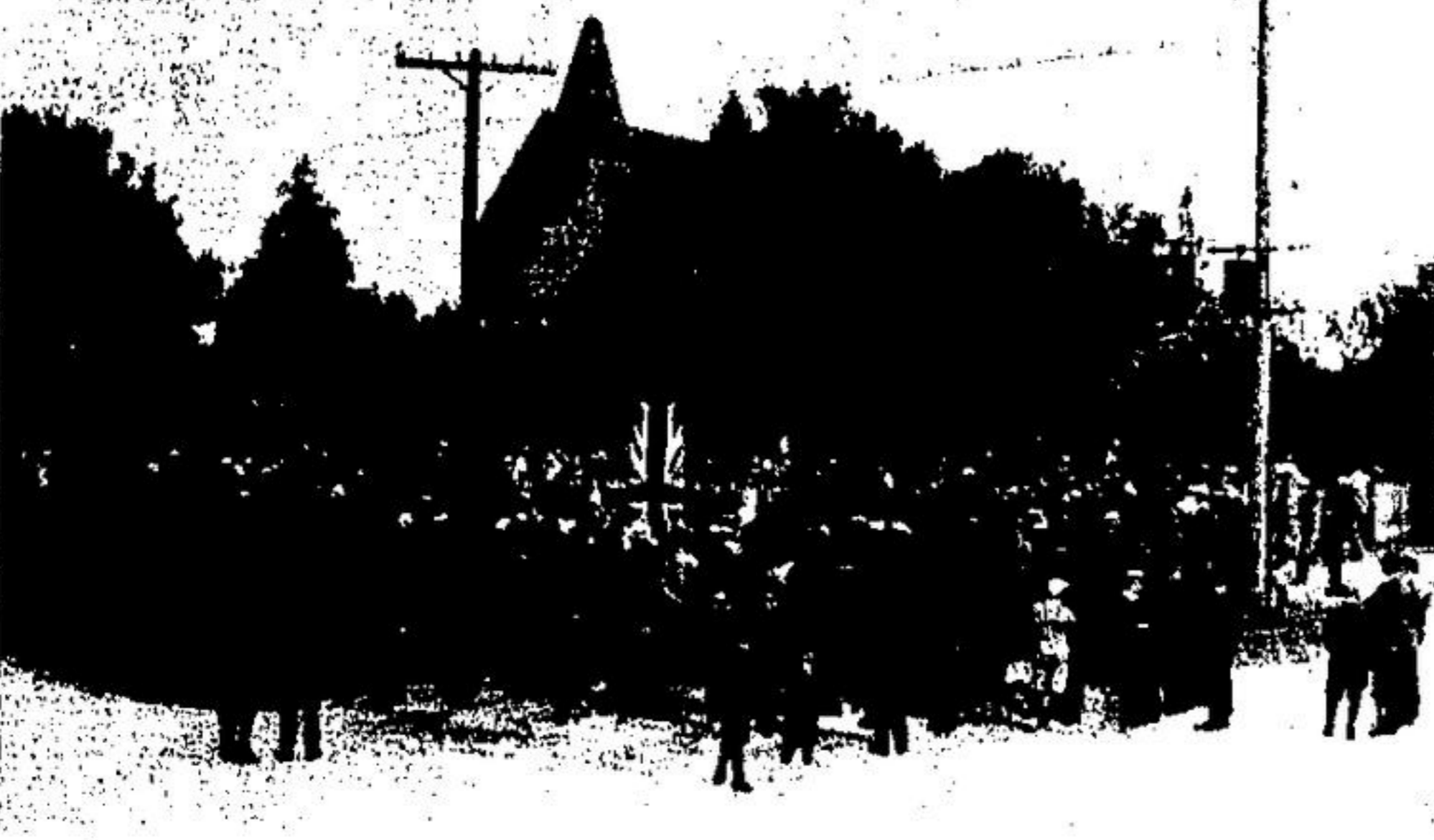
FIFTY YEARS AGO this scene was taken at the unveiling of the new Rockwood cenotaph. The scene has changed during that half century and new wings have been added to the cenotaph to commemorate the dead of another war but services of remembrance are still being held.