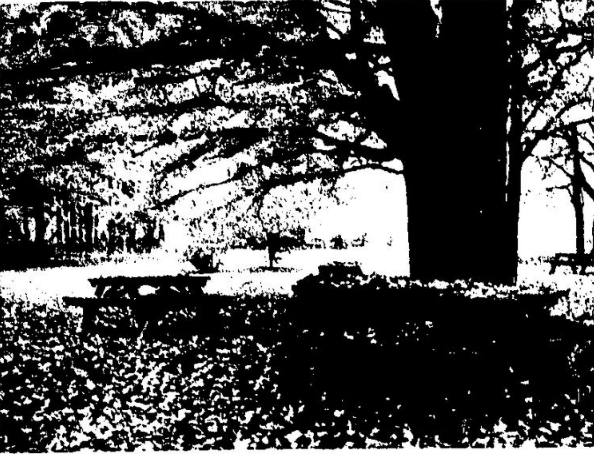
THE AFTERMATH of summer shows the Rockwood Conservation area disconsolate as leaves from the beautifully colored trees waft downward before the final blasts of wintry winds.