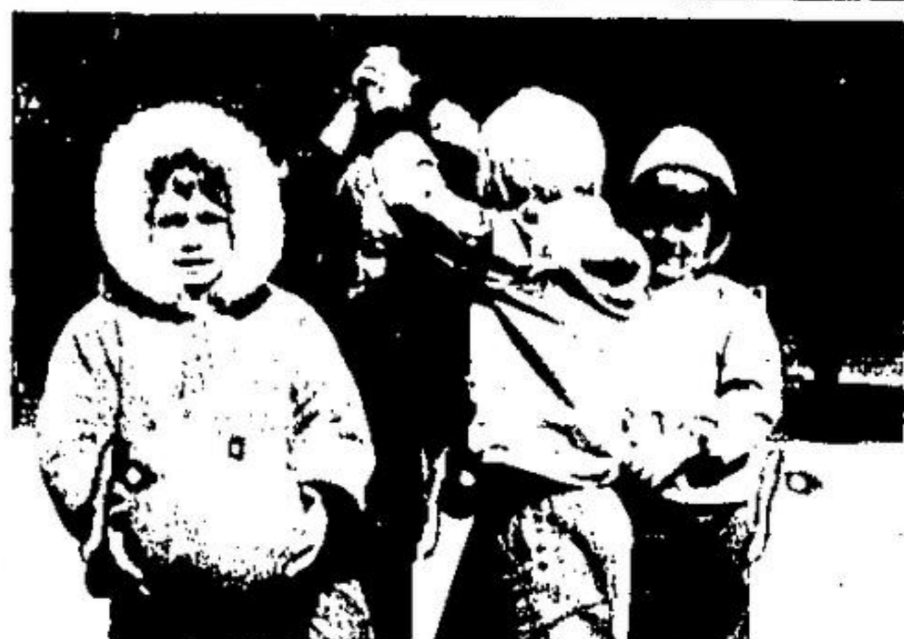
FOREBODINGS of "what's to come" are indicated by the parka worn by one Rockwood kindergarten school student during recess play-time recently.