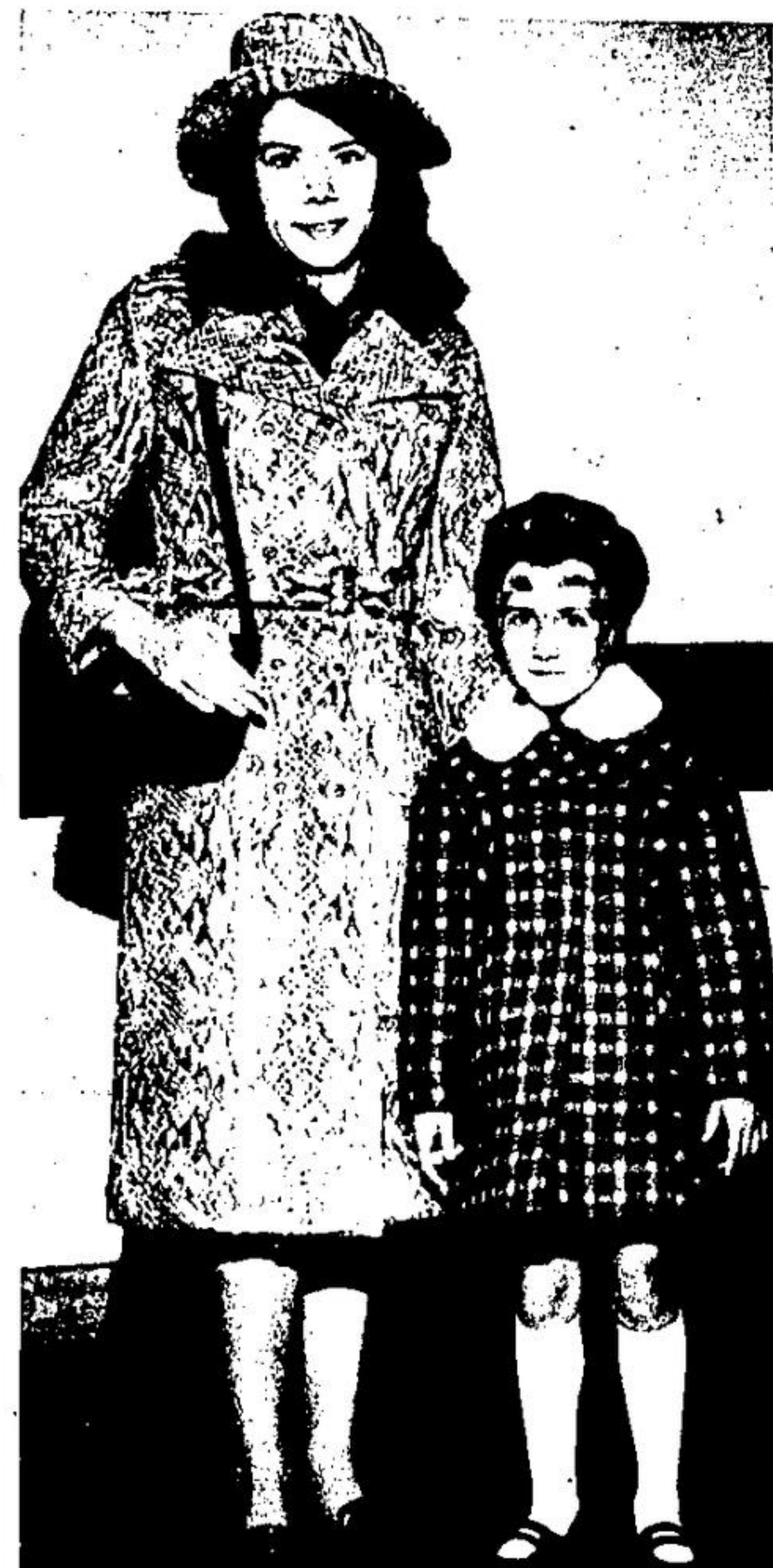
THE LONG AND the short of it, from a snakeskin longuette coat to still-popular minis. L'Arche Auxiliary forecast the season for 150 Actonians at a fashion show last week. Story and more pictures inside.