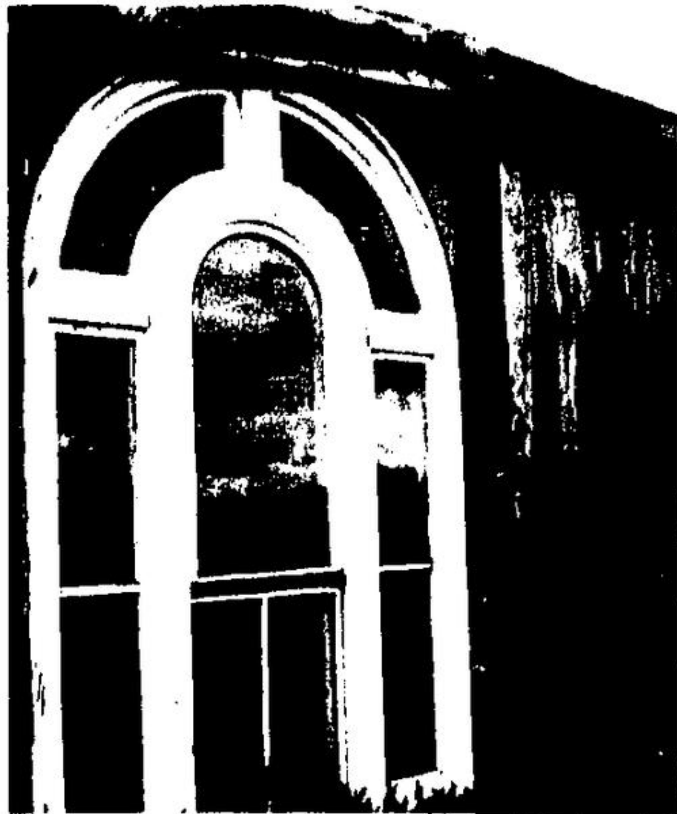
ROCKWOOD VISITORS to Open House at Elm Tree farm experienced a grimace of nostalgia as they viewed the gothic arched window in Martha Hooy's studio. It originally enhanced the second floor of the old S.S. No. 9 schoolhouse, just over the entrance doorway, and is now an interesting item in its new location.

LEAVES ARE showing their fall colors. The best display of all, each year, seems to be along the highway between Acton and Milton.