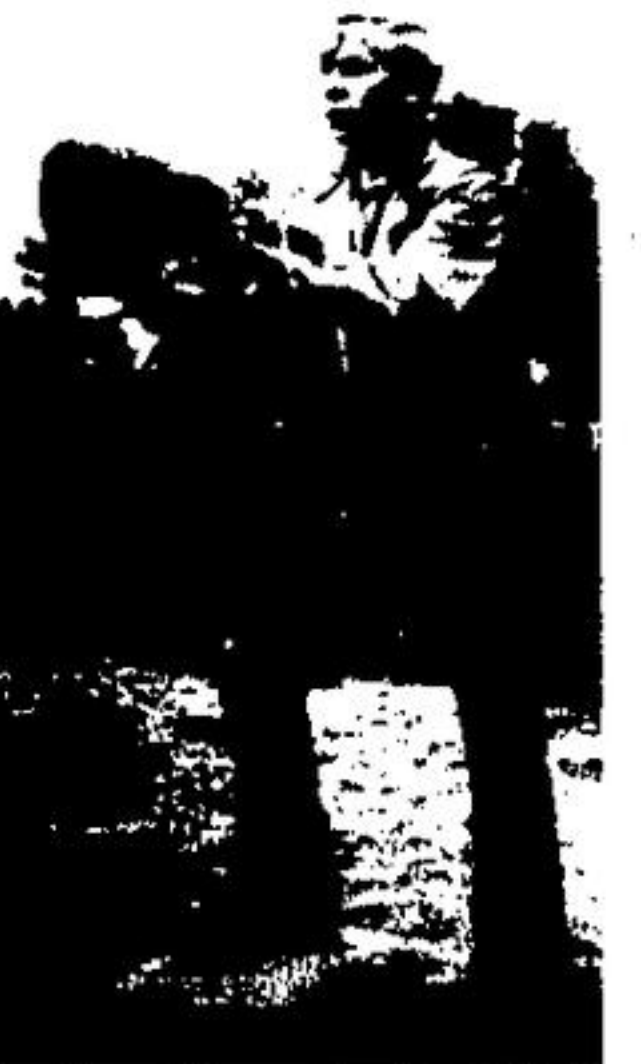
STEVE ELLIS of R.R. 4, Rockwood, warms up in the bull pen before the bantam game at last Sunday's performance at the Rockwood Ball Park.

LEAVES ARE showing their fall colors. The best display of all, each year, seems to be along the highway between Acton and Milton.