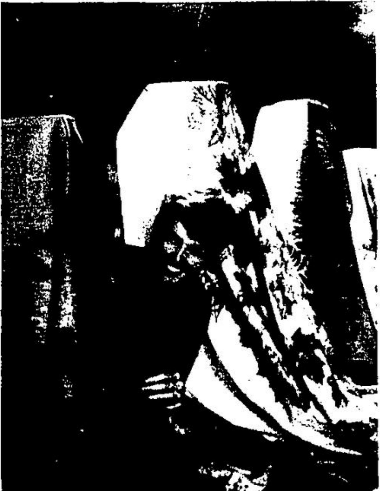
BETTY LOU Clark of Rockwood steals a glance at a customer from between bolts of screen-printed table cloths at last weekend's Elm Tree Farm Open House. — (Photo by Lorraine)

hand-woven rug composed of wool from the sheep of Elm Tree farmlands. — (Photo by Lorraine)