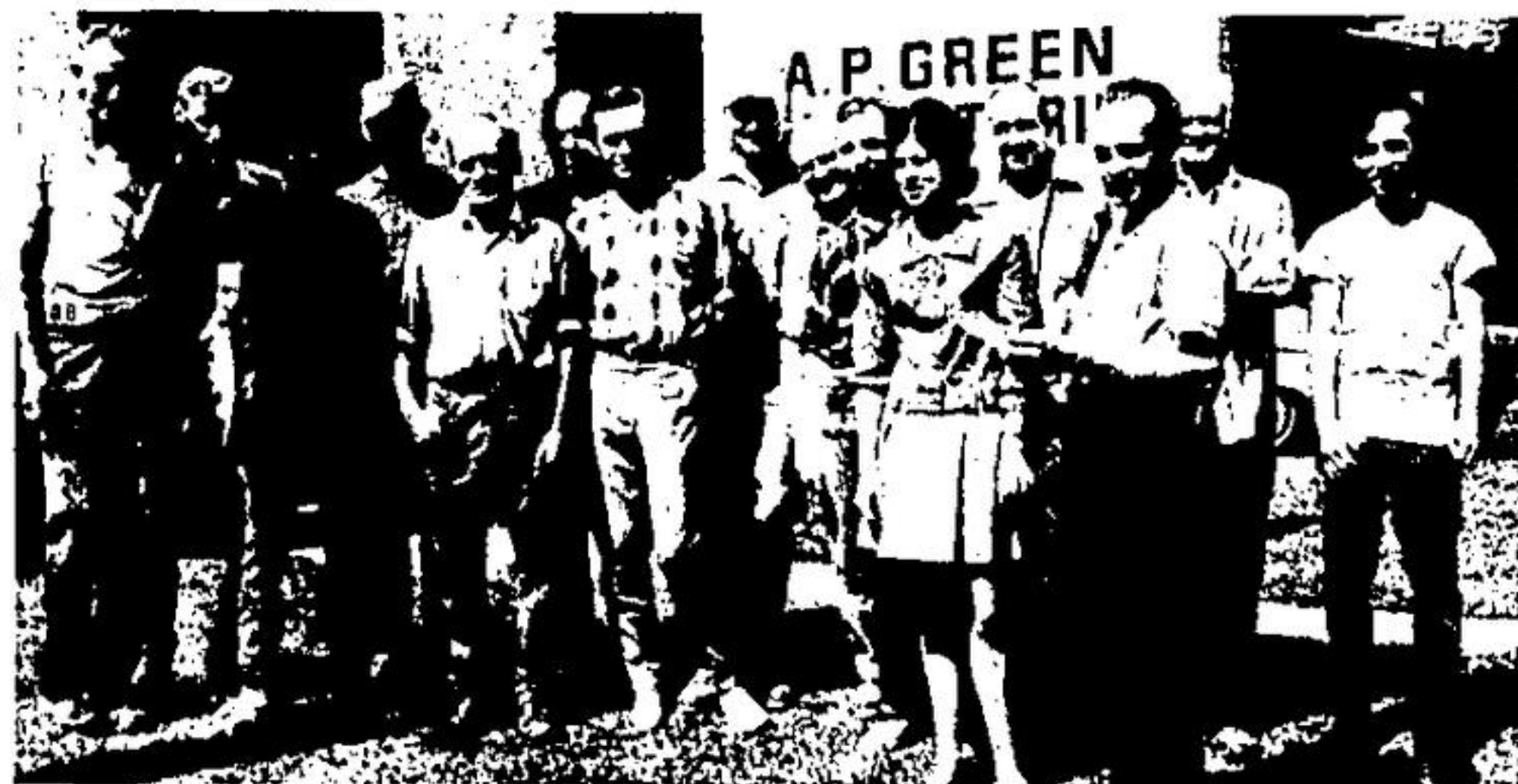
August 11, 1970 was a special date for the staff of the Acton plant of A.P. Green Refractories (Canada) Ltd. They completed four years without a lost time injury.

"We'll guarantee an answer in writing," he assured the delegation, who announced they would have observers at all meetings of council.