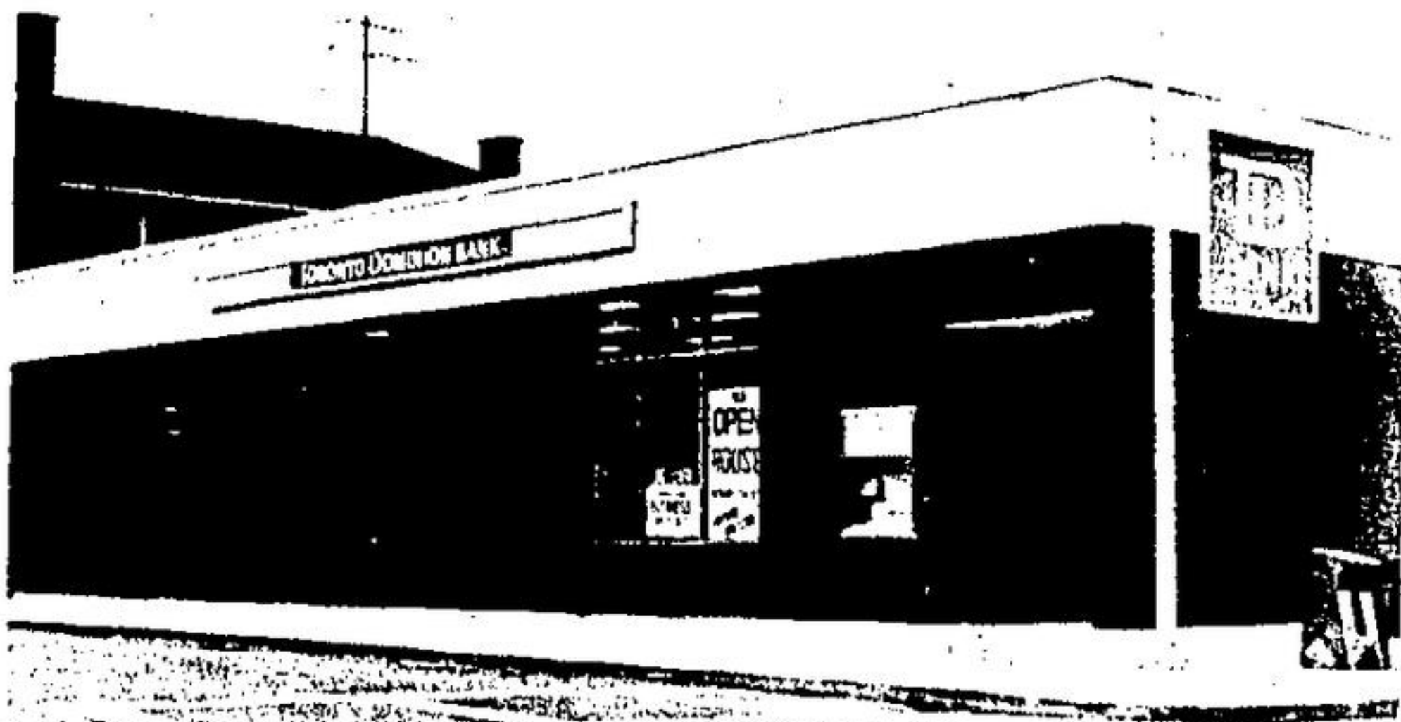
ACTON'S FOURTH bank, the Toronto-Dominion will hold Open House Monday October 5 and will be open for business Tuesday morning October 6. The new bank is located at the corner of Mill and Willow Streets, on land formerly occupied by the town's old post office.

"The future of Acton looks good, and we would like to grow with it," smiles Acton's fourth and newest bank manager.