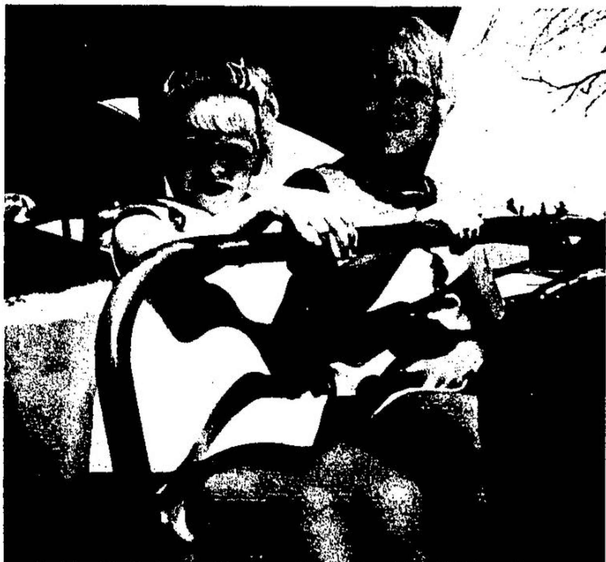
WHEN TWO GIRLS get into a midway ride they hold on tight but can manage a smile for the camera.