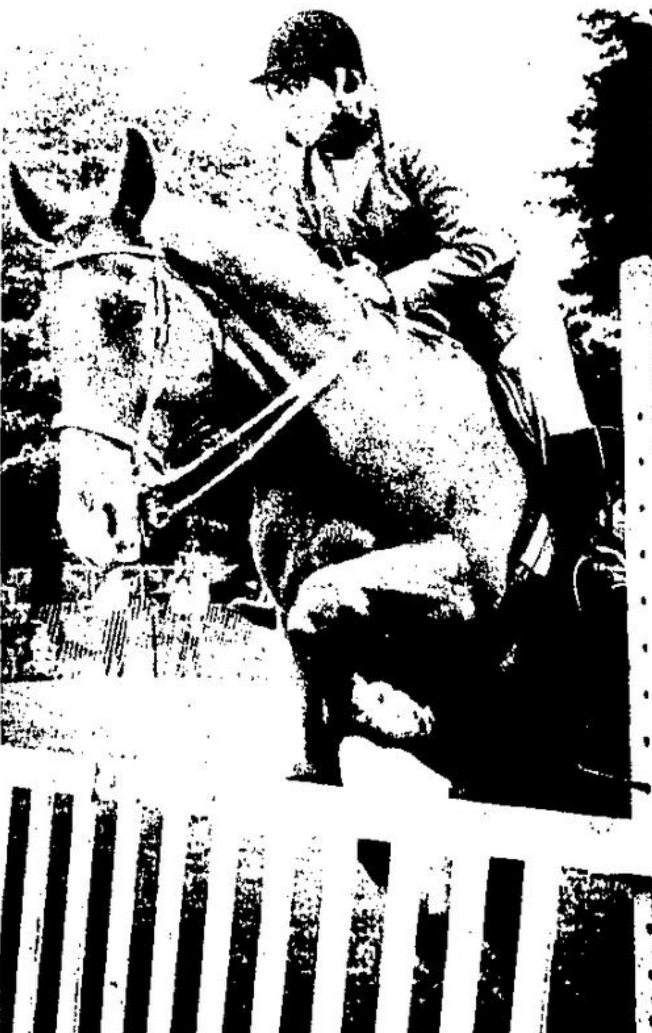
THERE WAS a "fair" amount of entries in Saturday's Fair jumping competitions. This mount cleared the first hurdle but balked at the remainder.