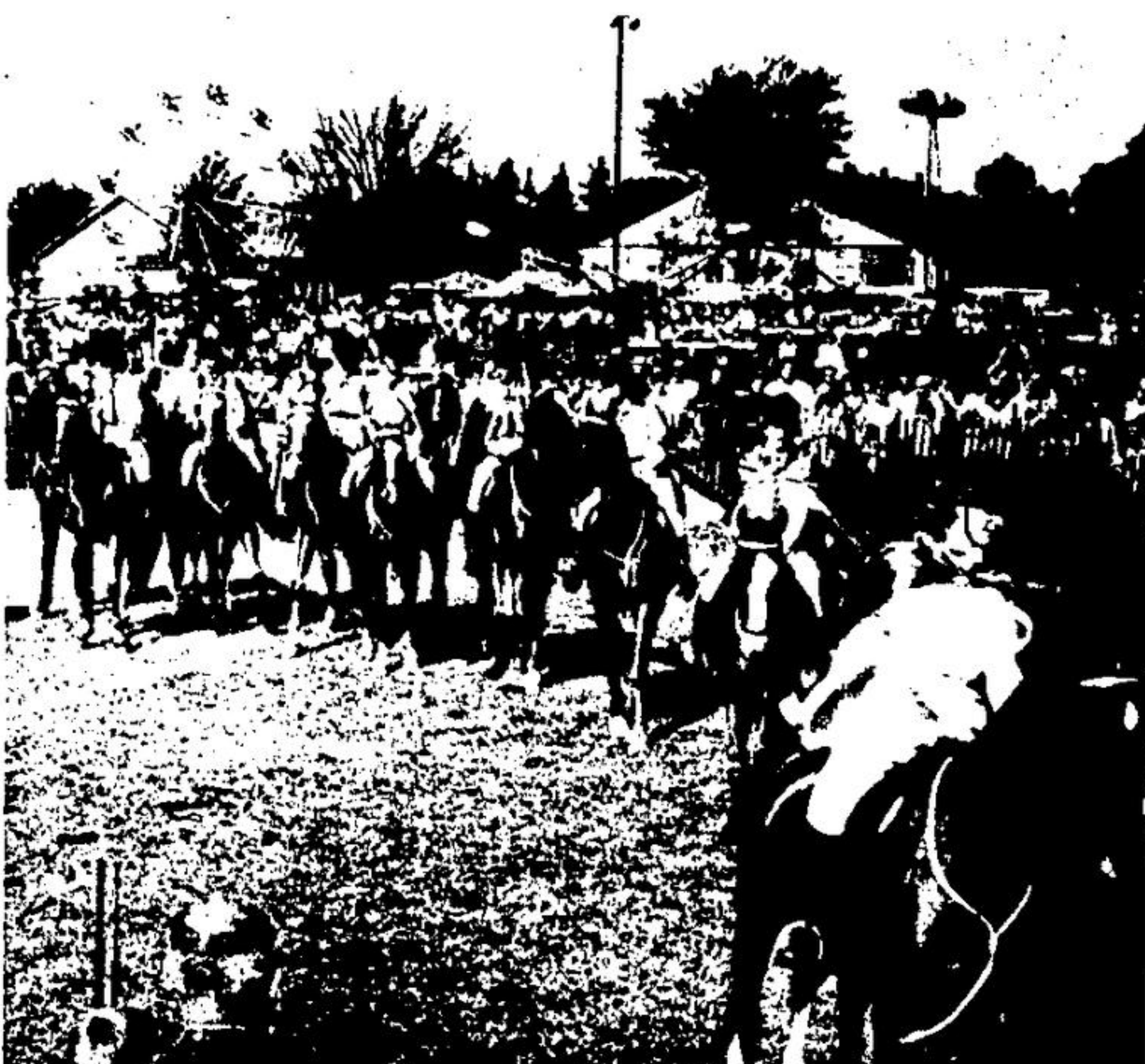
MUSICAL RIDE by Almar Stables, near Palermo, won a feature of the Saturday afternoon program at the