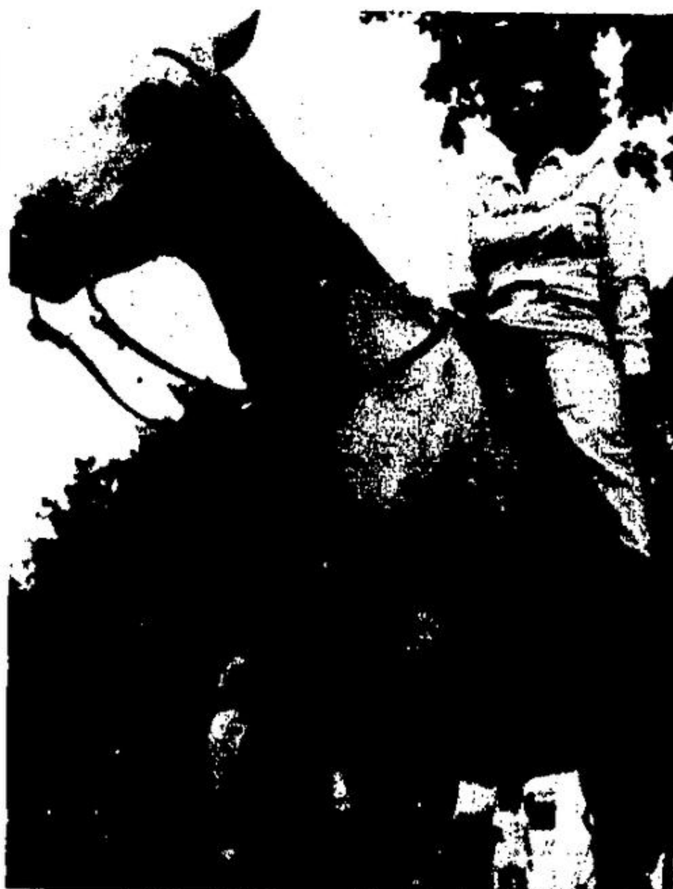
DI DUNCAN of Rockwood competed in Acton Fair's Saturday's horse show on her favorite mount.