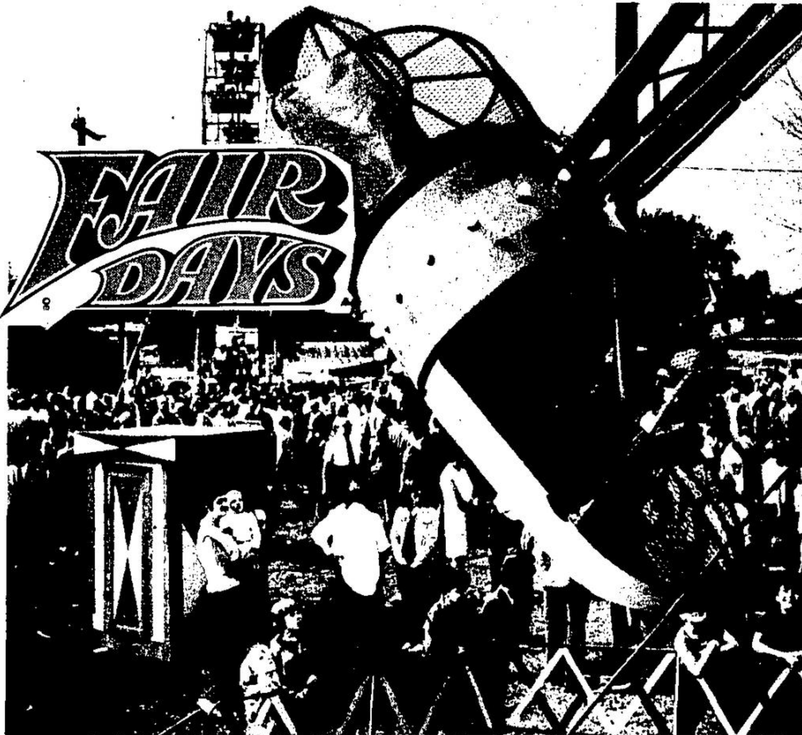
MIDWAY RIDES attracted thousands at Saturday's Fall Fair and kept going well into Saturday evening. The midway started operation Thursday, was crowded