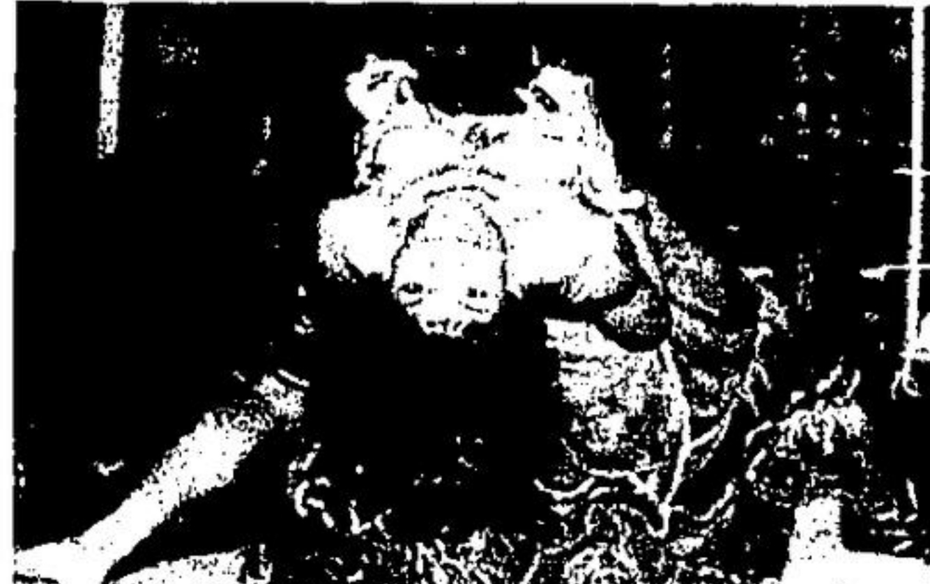
ALL EYES WERE on dancer Peggy Jackson when she limboed for a crowd estimated at over 2,000 in the