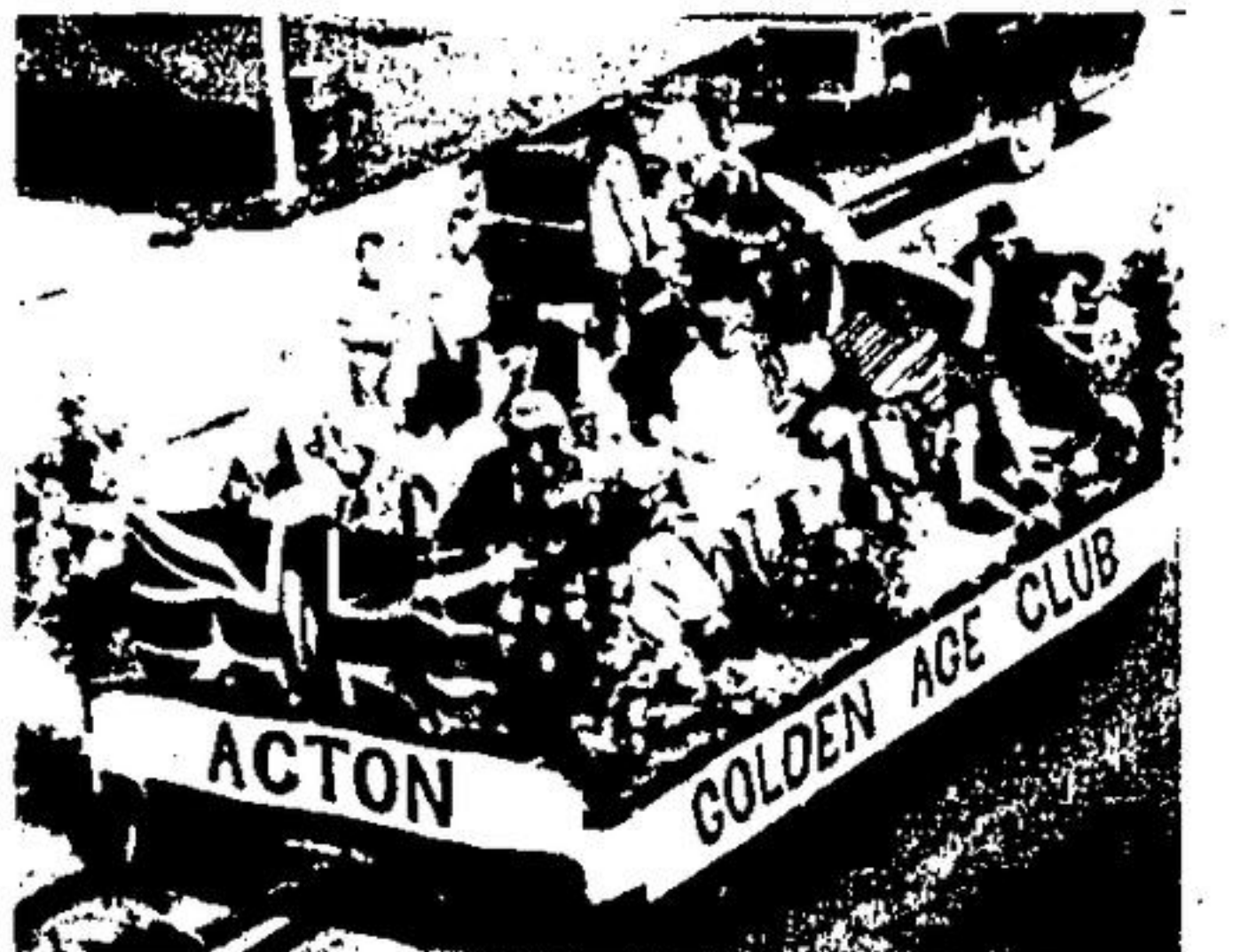
THE GOLDEN AGE Club float took first prize in the service club competition during Saturday's Fair parade.