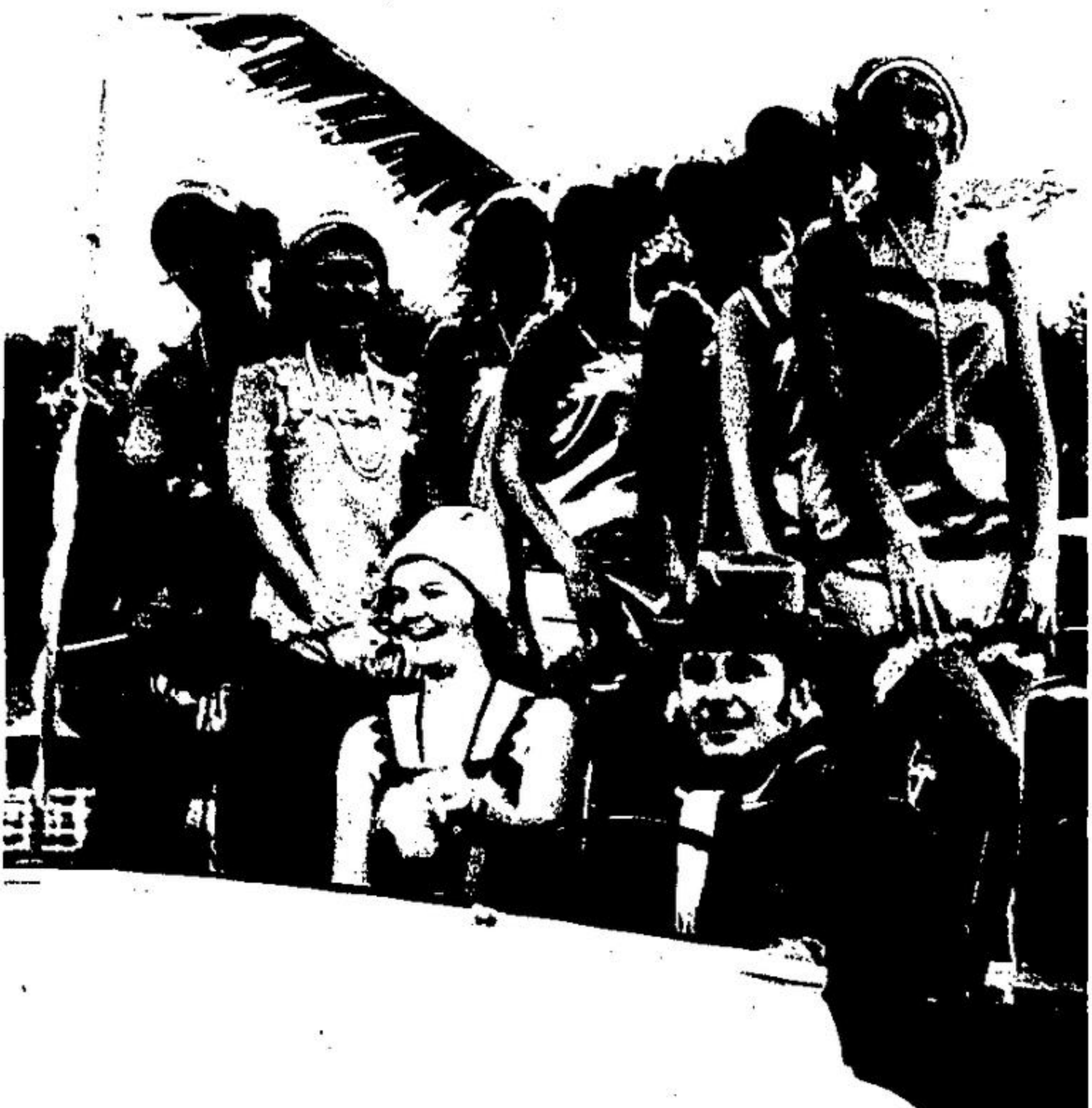
NOVELTY PRIZE FLOAT was the Canadian Tire entry with a bevy of flapper era charmers, fur coated chaperones and loads of 23 Skidoo. The honky-tonk piano made it jump.