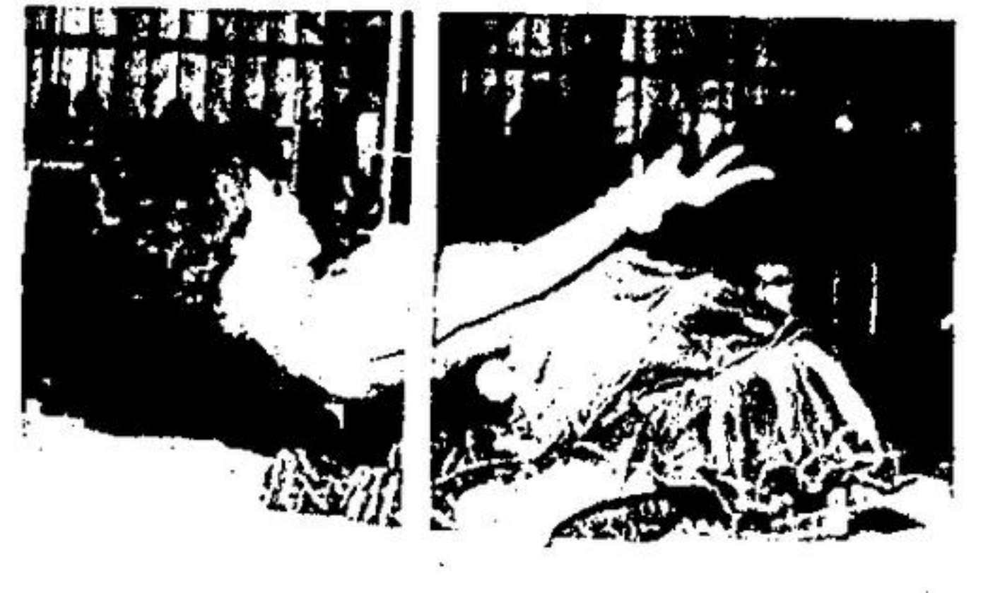
community centre. Finale of the act was a dance under a rod of fire.