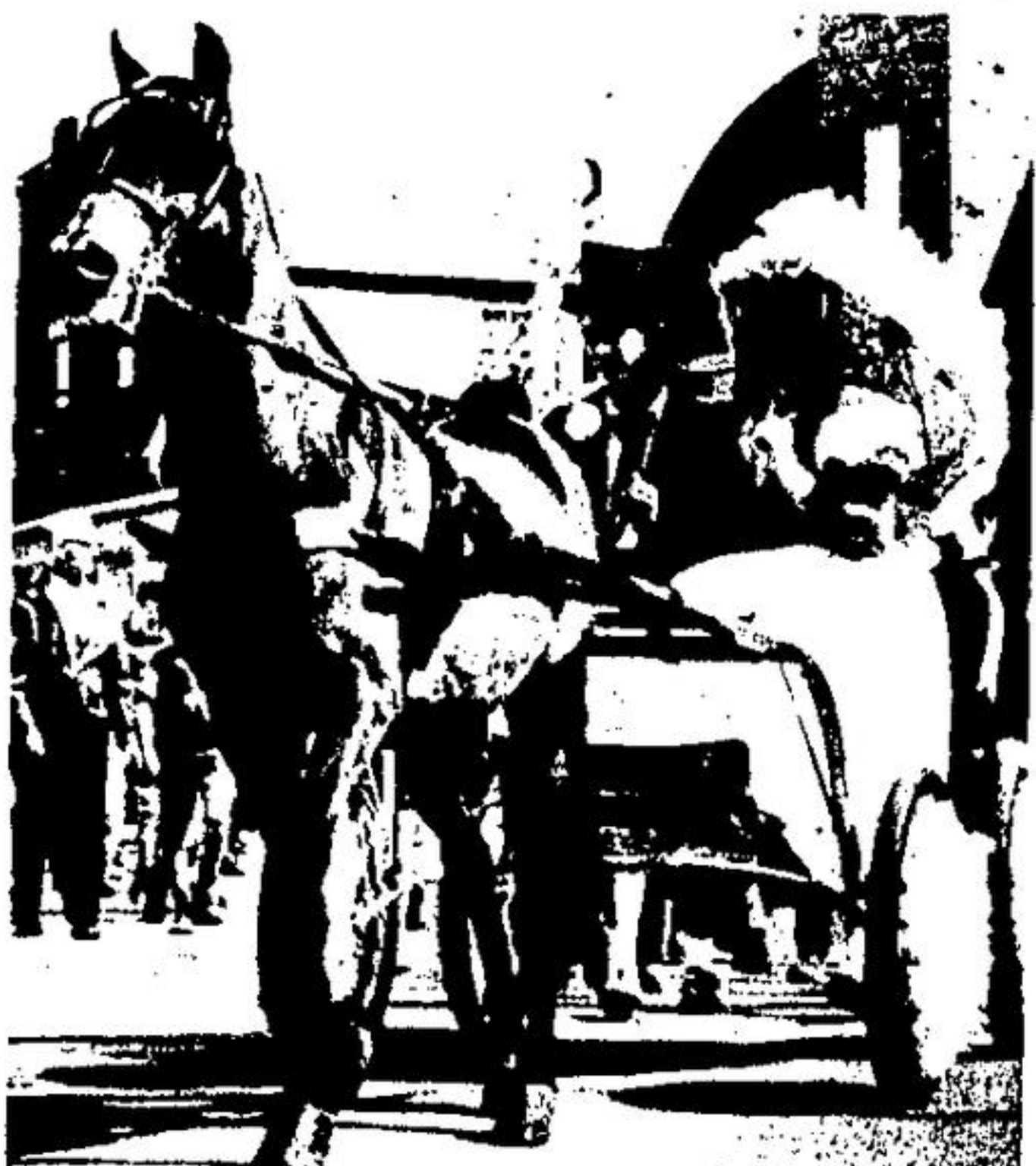
THIS BEAUTIFULLY decorated horse and buggy, with gentleman and lady riding, was a colorful entry in the Fall Fair parade.