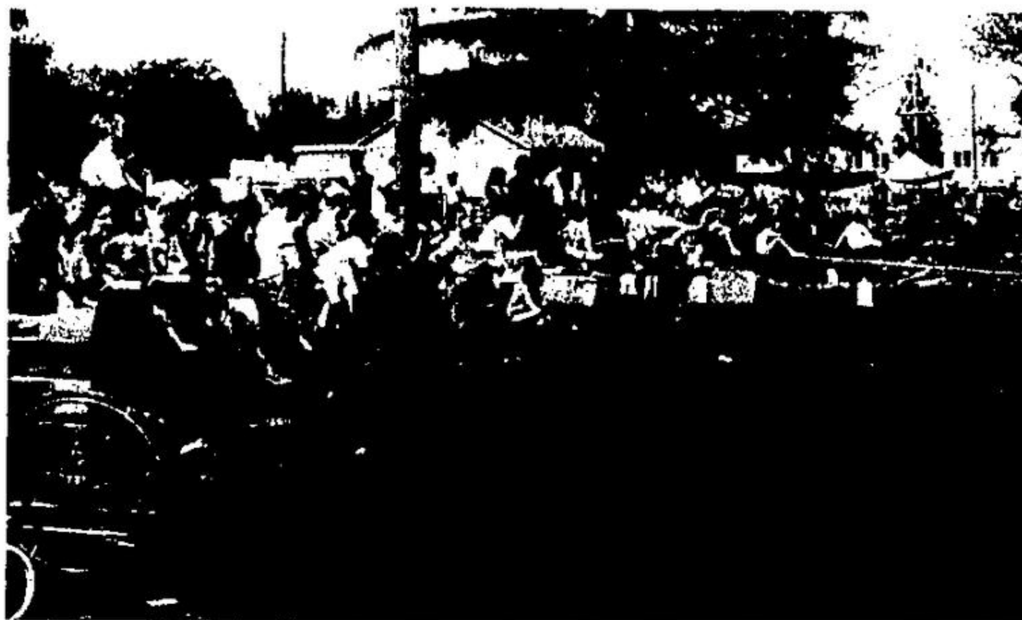
ACTON HI-FLYERS' model airplane combat competition attracted a large

portion of the crowd attending Sunday's Sportsmen's Show.