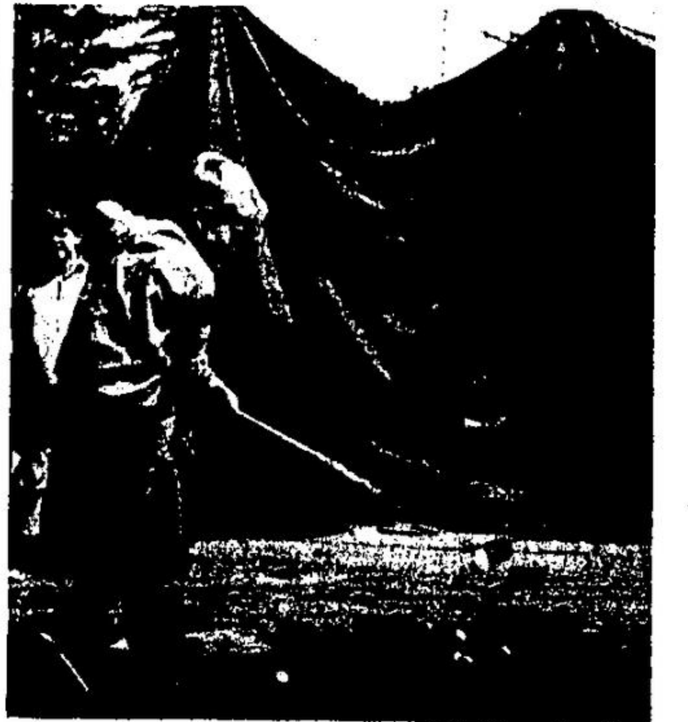
PETER NELSON tees off at the Acton Meadows' sponsored driving range at Sunday's Sportsmen's Show.