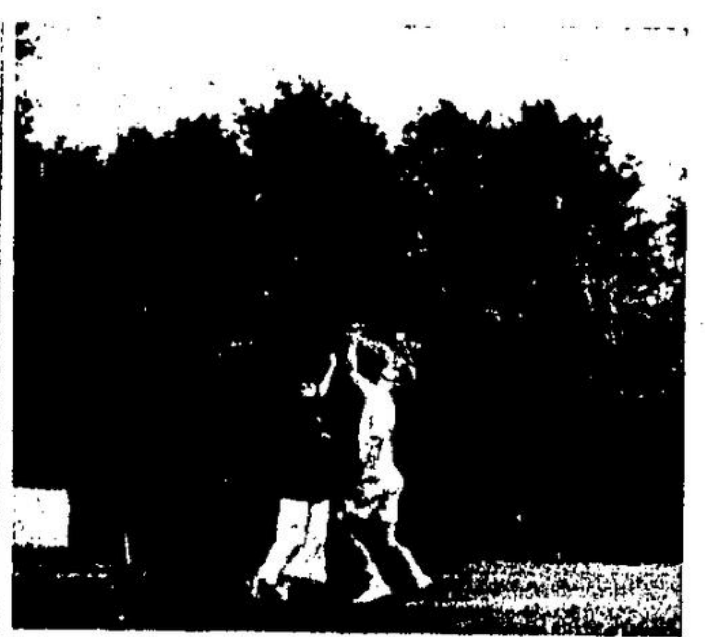
TWO CONTESTANTS in the combat division vie for honors in the Acton HI-Flyers model airplane competition, Sunday.

for Sunday's Sportsmen's Show. The boats drew a large number of spectators to the shores of Fairy Lake, at the far end of Prospect Park.