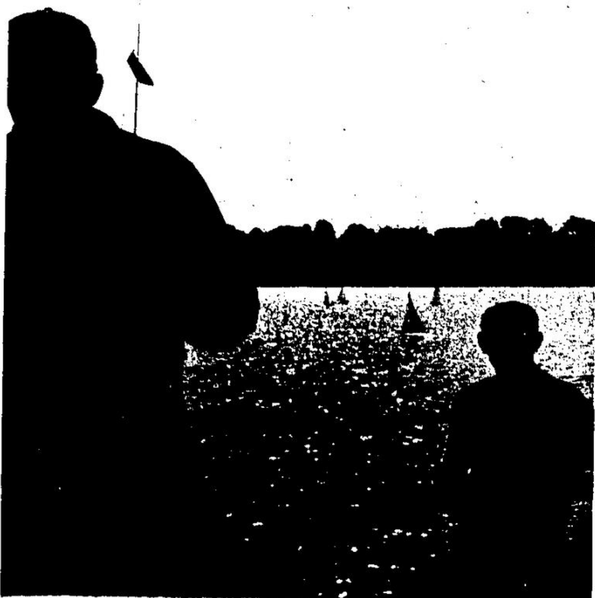
FAIRY LAKE'S SPARKLING waters provided an ideal setting for the demonstration of the ten rater class of radio-controlled sailboats at Sunday's

Sportsmen's Show. The boats sailed around a triangular course, in a windward direction.