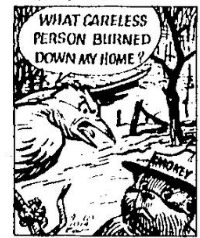
... was it you?