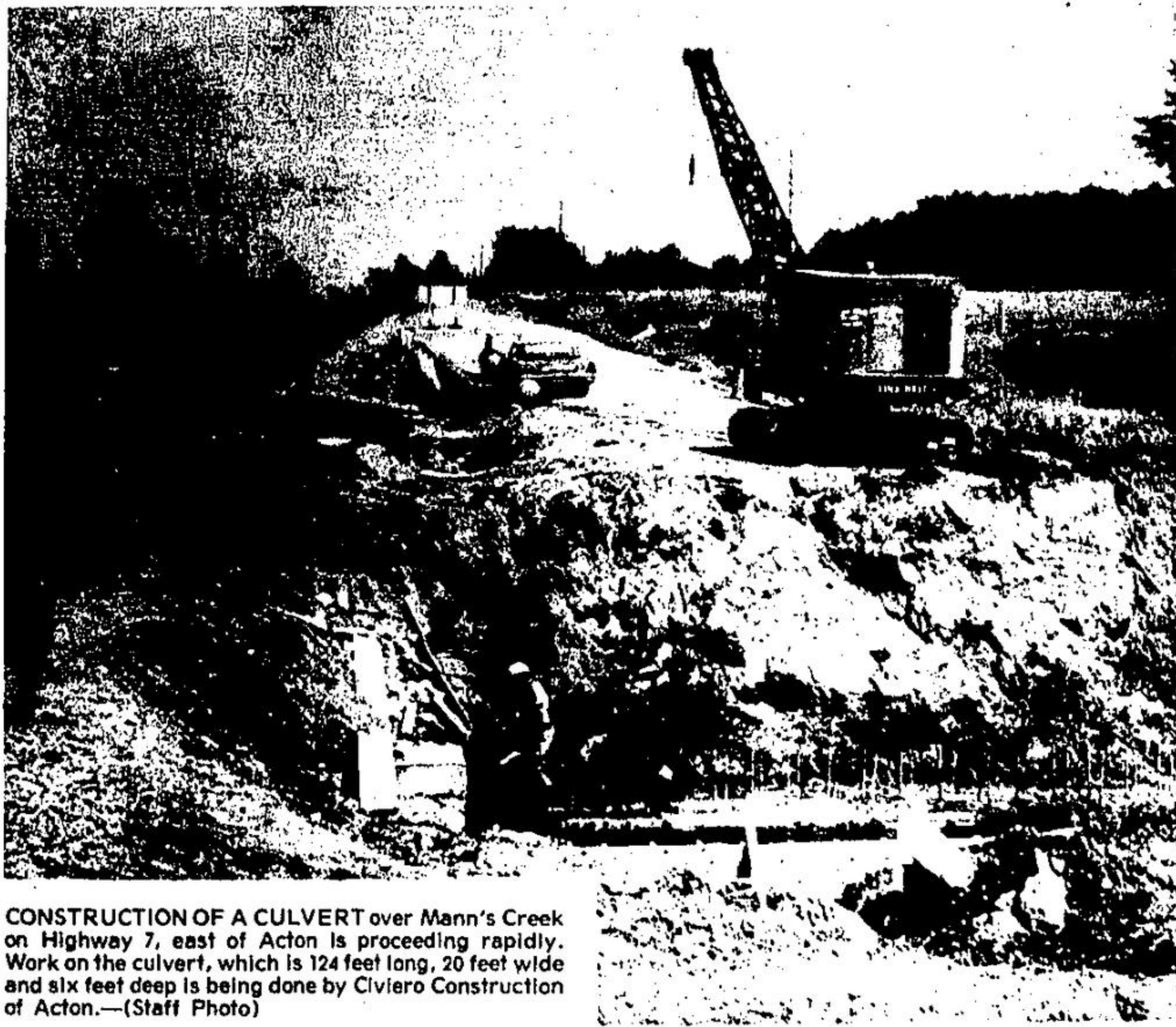
CONSTRUCTION OF A CULVERT over Mann's Creek on Highway 7, east of Acton is proceeding rapidly. Work on the culvert, which is 124 feet long, 20 feet wide and six feet deep is being done by Civiero Construction of Acton.