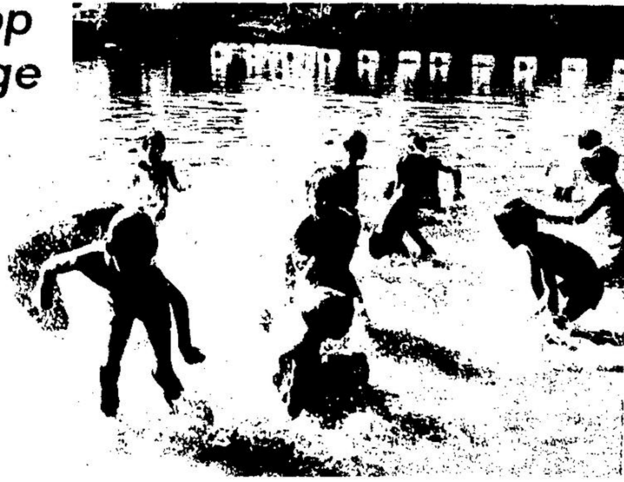
AFTER A SLEEPOUT IN Prospect park Thursday night, youngsters enrolled in the Acton Playground program, cooled off with a splash party in Fairy Lake, Friday morning.