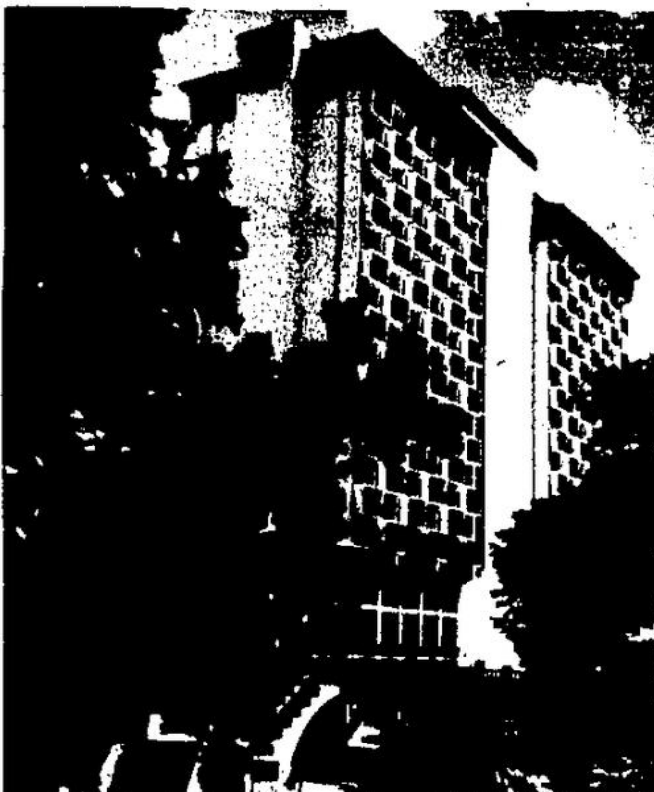
THE NEW HILTON HOTEL Palacia del Rio, in San Antonio, Texas was the first building ever erected using the new construction system. It was built in a record nine months to be ready for HemisFair '67. A similar system is being used at the new plant.

The units may be seen easily from No. 25 highway by Actonians driving south to 401 highway.