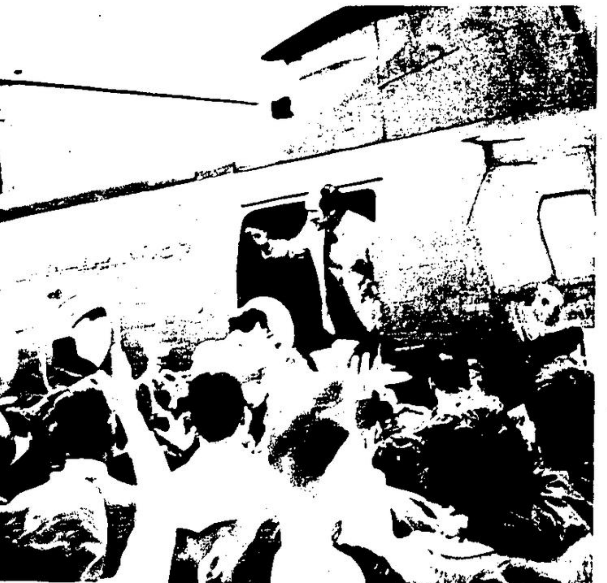
WAVING GOODBYE to the crowd, after officially opening the United Breeders artificial insemination building near Guelph, Saturday.—(Staff Photo)