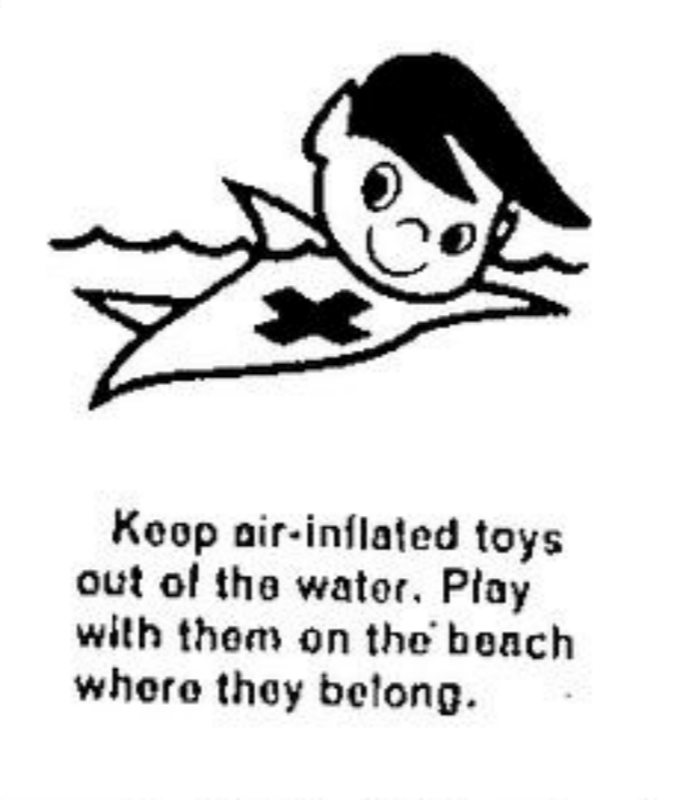
Keep air-inflated toys out of the water. Play with them on the beach where they belong.