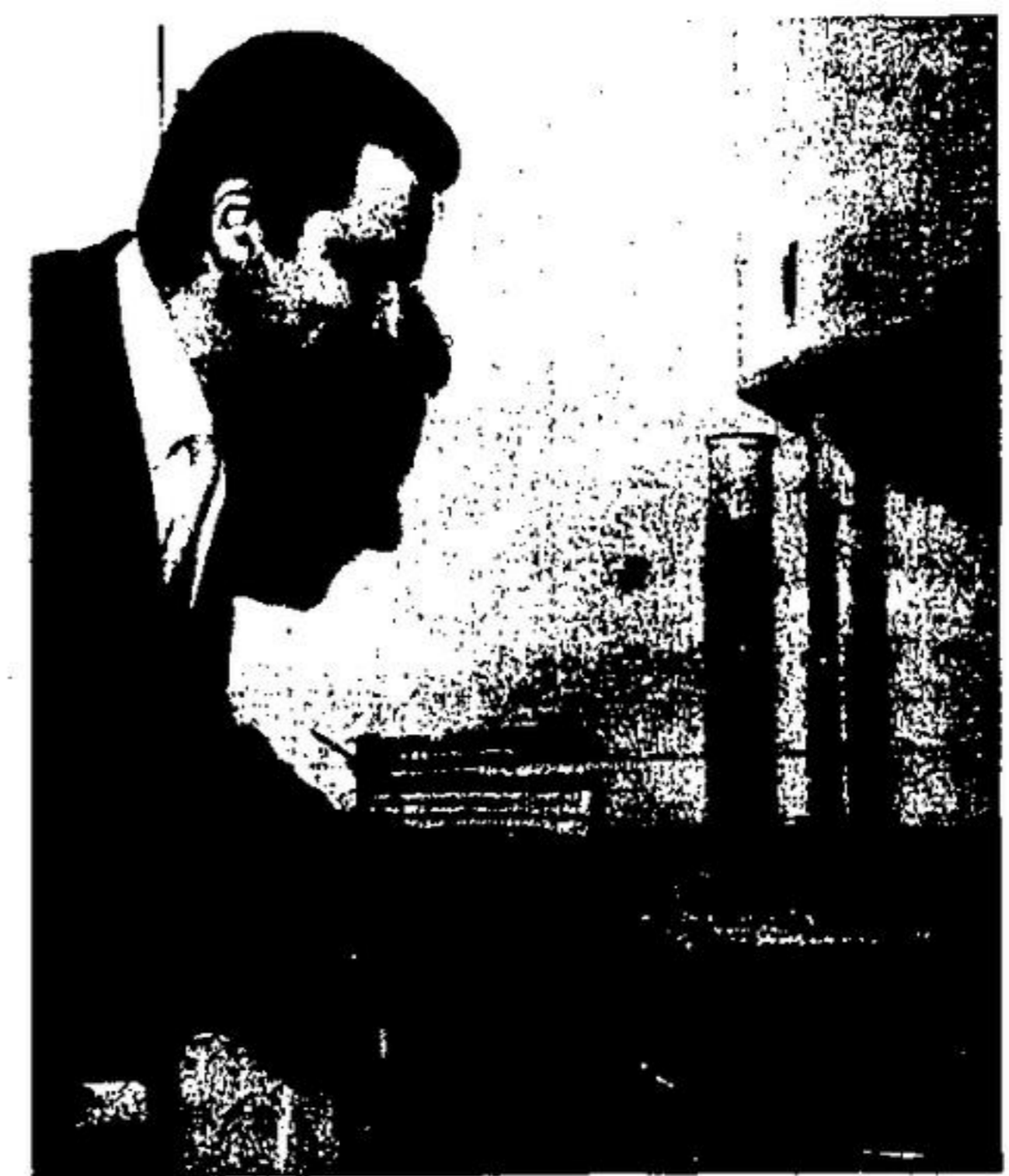
... and the water's fine

Council accepted the planning board recommendations rejecting objections to the 70 foot height, one which was based on the interpretation of the word "about".