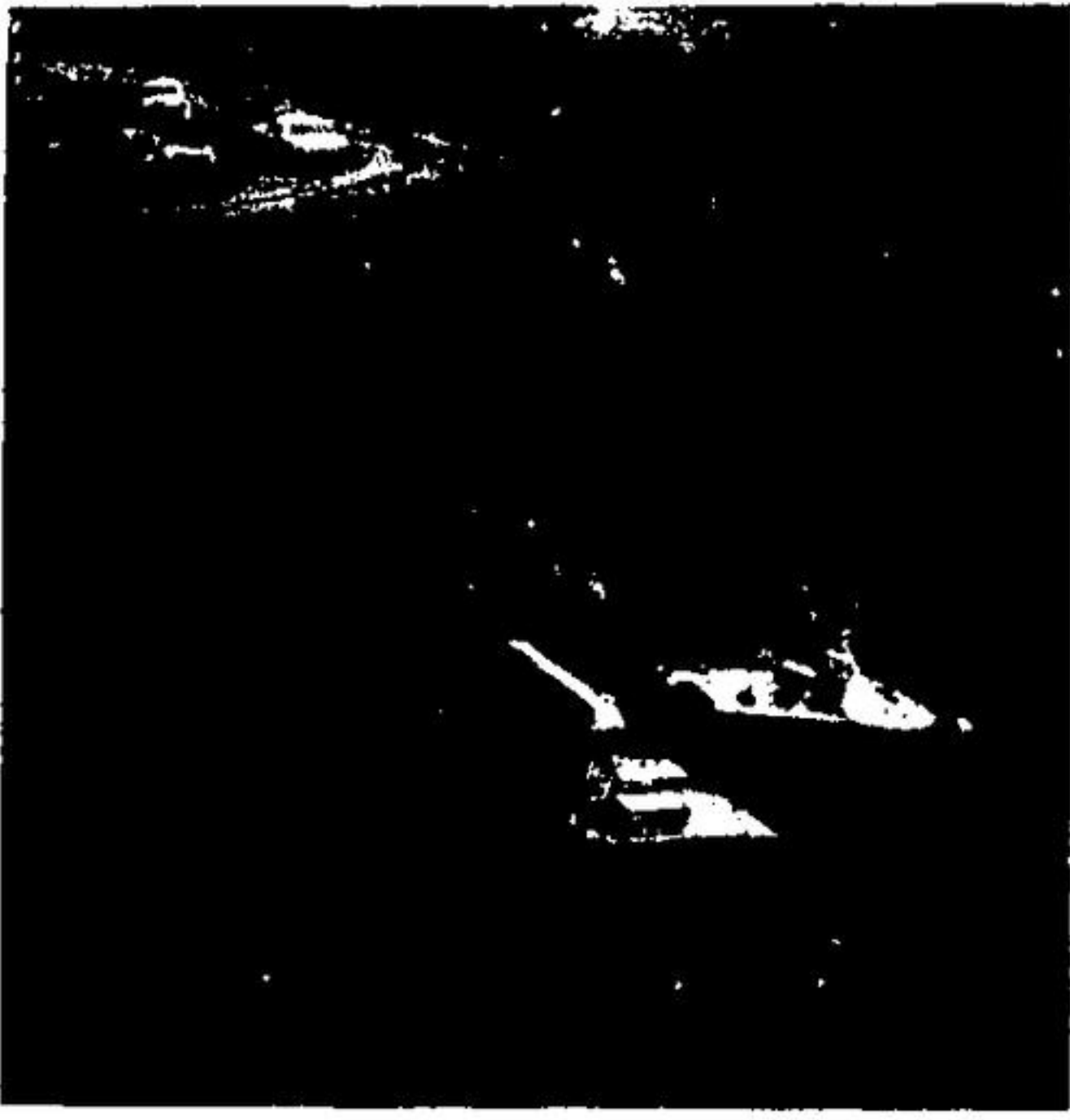
COURSE OF THE Black Creek which meanders through the picturesque Beardmore valley had to be changed so the adjacent swamp would not interfere with construction of the addition at the water pollution control plant. The creek bed was lowered nine feet and part of a hill removed. This view was taken almost a year ago.