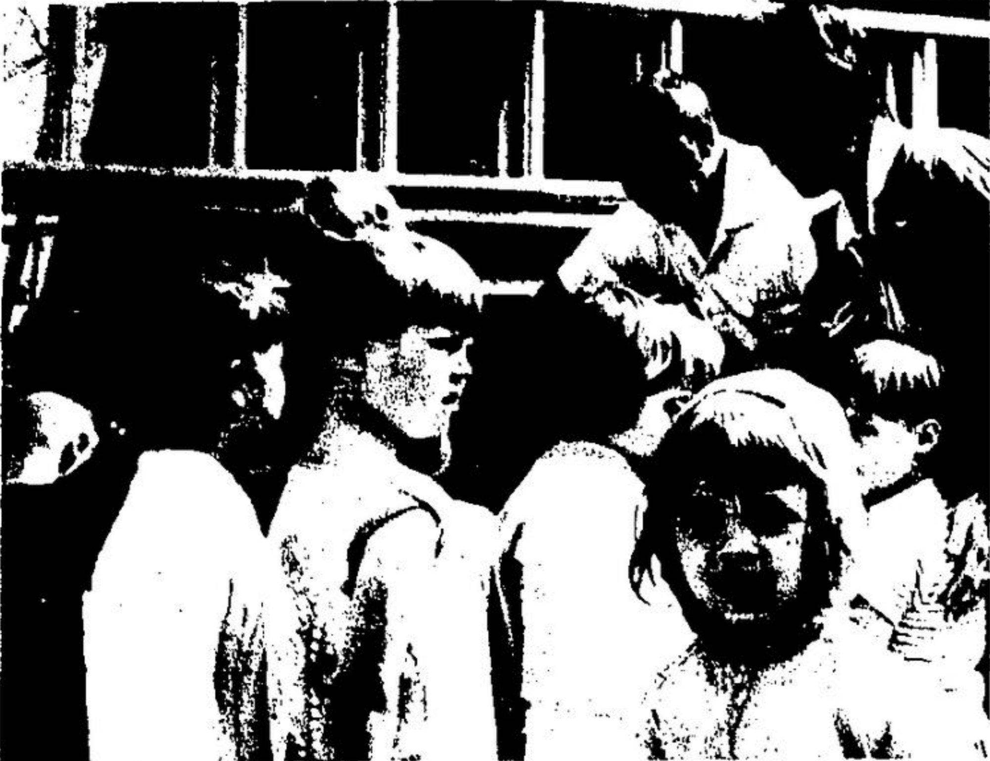
Nursery class tours Rockwood fire hall

It will not, however, be a completed deal until the proposal has gone before the Ontario Municipal Board at which time any letters of disagreement from any source will be read and hearings for the dissenters set up and, not until the Board establishes the absolute necessity of the project will the O.M.B. give its approval for the Village to have its new sewage and water system.