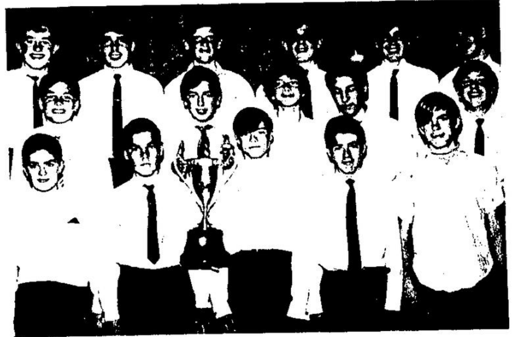
M. Z. BENNETT BOYS' changed voices choir brought the school honors by winning the first place Milton Public School Board trophy at the North Halton Music Festival, last Wednesday.