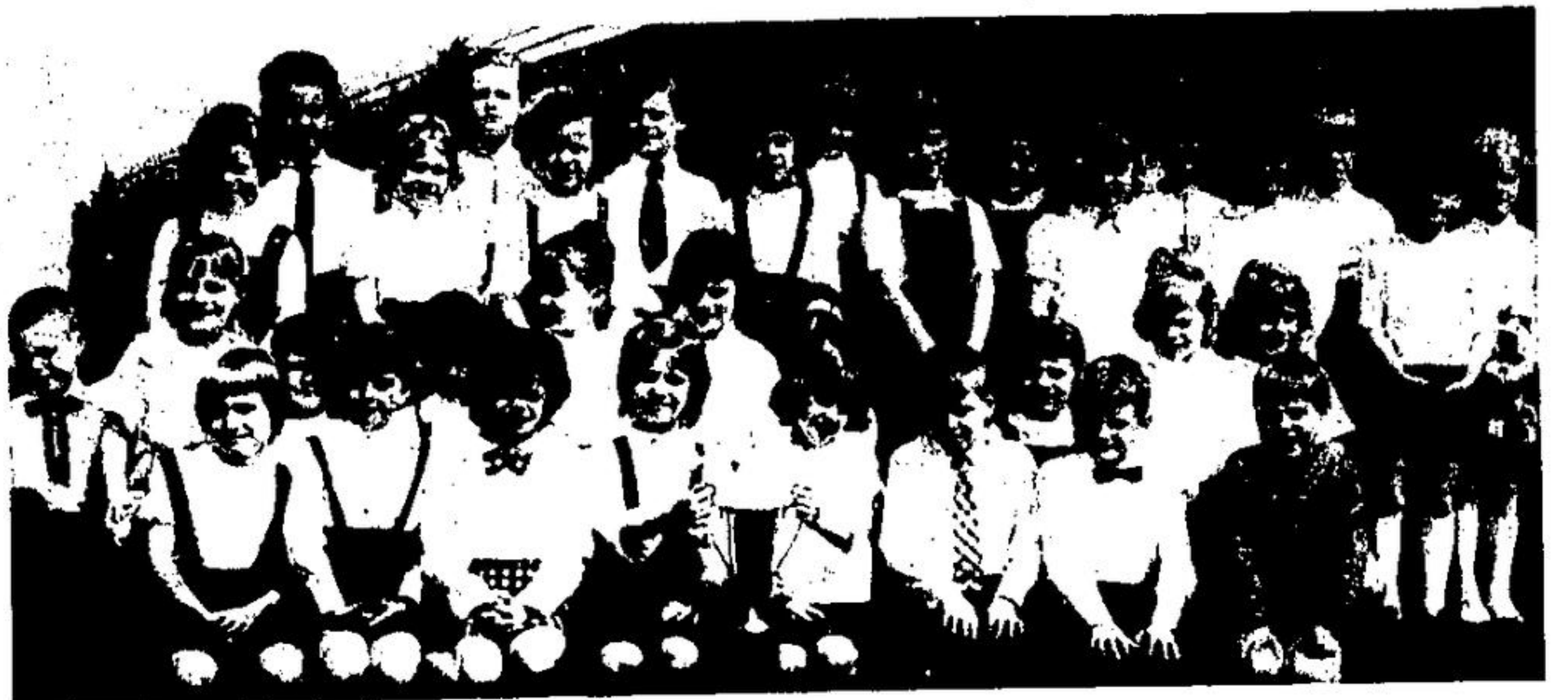
M. Z. BENNETT School primary choir scored 85 points to nose out Glen Williams and Limehouse for the first place John Milton IODE trophy at the North Halton Music Festival, held at M. Z. Bennett last

top Brookville and Georgetown Chapel Street, who placed second and third respectively.