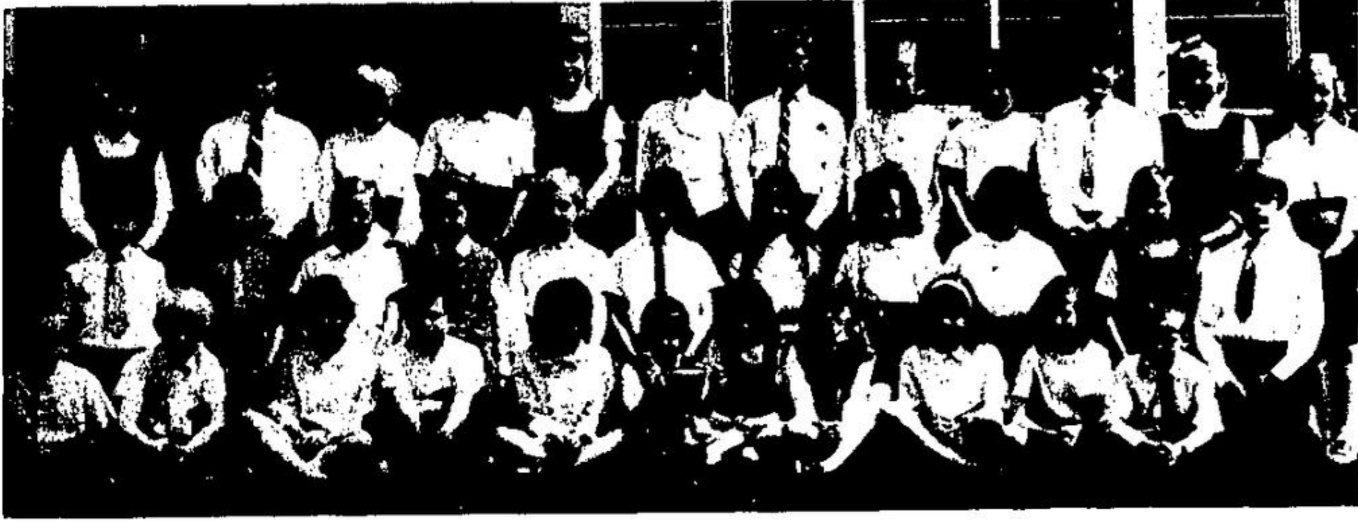
BROOKVILLE SCHOOL INTERMEDIATE choir sang "Ah Lovely Meadows" to win the Acton Lakeside IODE trophy for first place in the North Halton Music Festival. Brookville received a total of 87