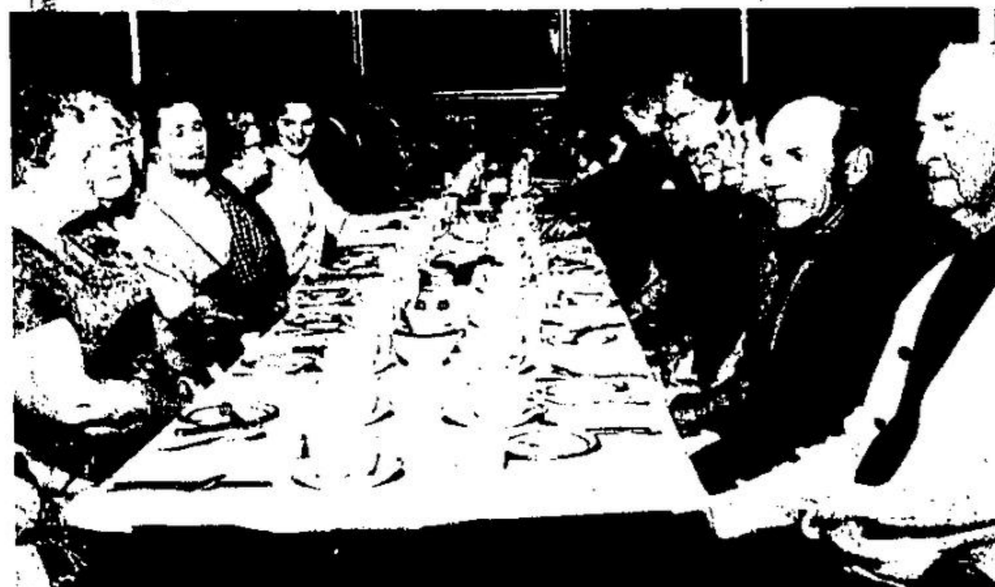
"LUNCHEON IS SERVED", a catering organization served a delicious meal to Church, Monday night. The supper was a fund raising project of the Church's ladies' group.