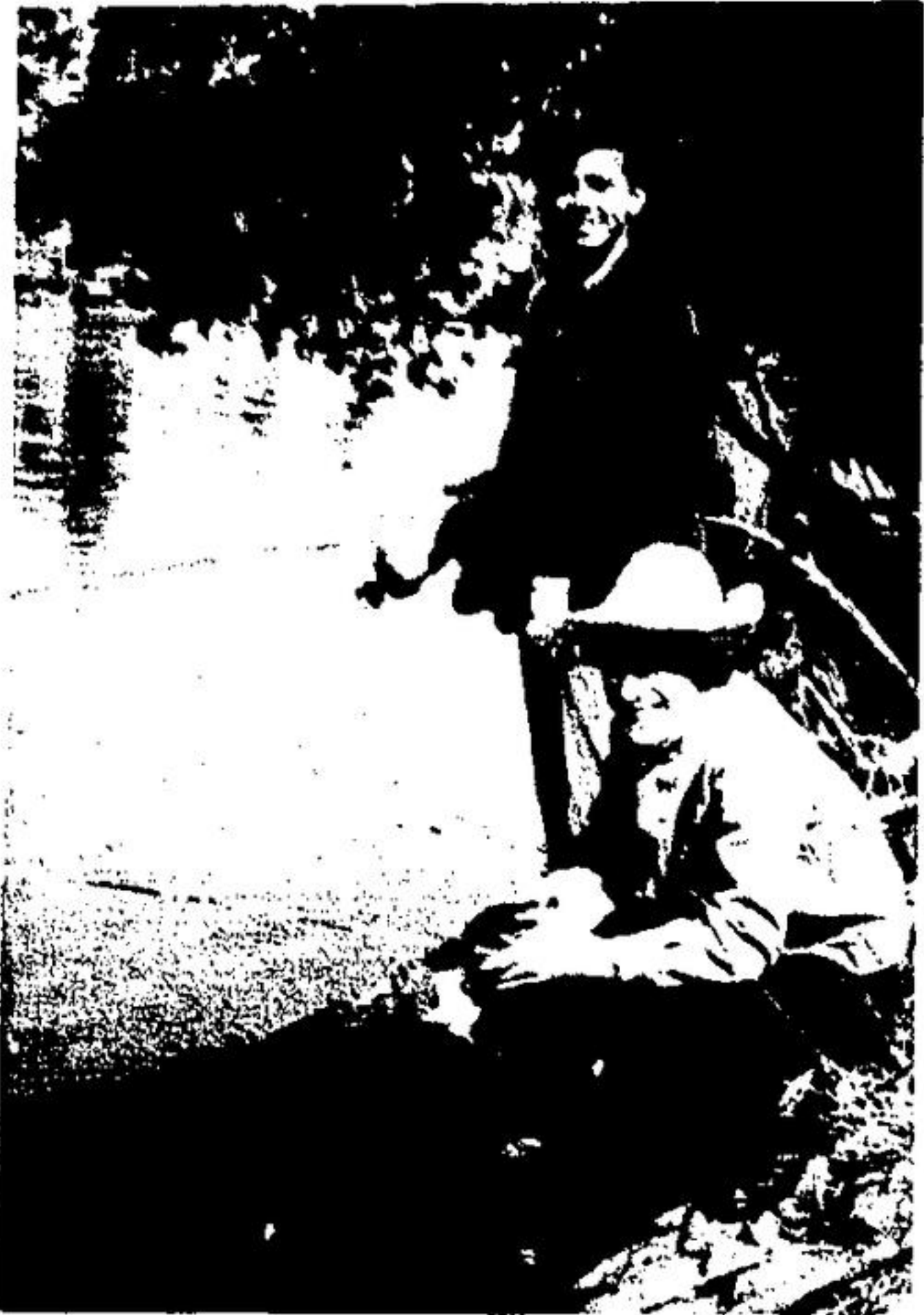
FIRST FISHING spree of the season got off to a good start last Sunday morning as throngs of adults and children alike congregated on the Rockwood bridge to try their luck. Five o'clock a.m. may have been an early start for many people but to avid fishermen who have been waiting all winter to cast their lines upon the water it was not and with the Rockwood Fish and Game Reserve having put large quantities of speckles and rainbows into the Eramosa stream many local enthusiasts were out trying their skill.