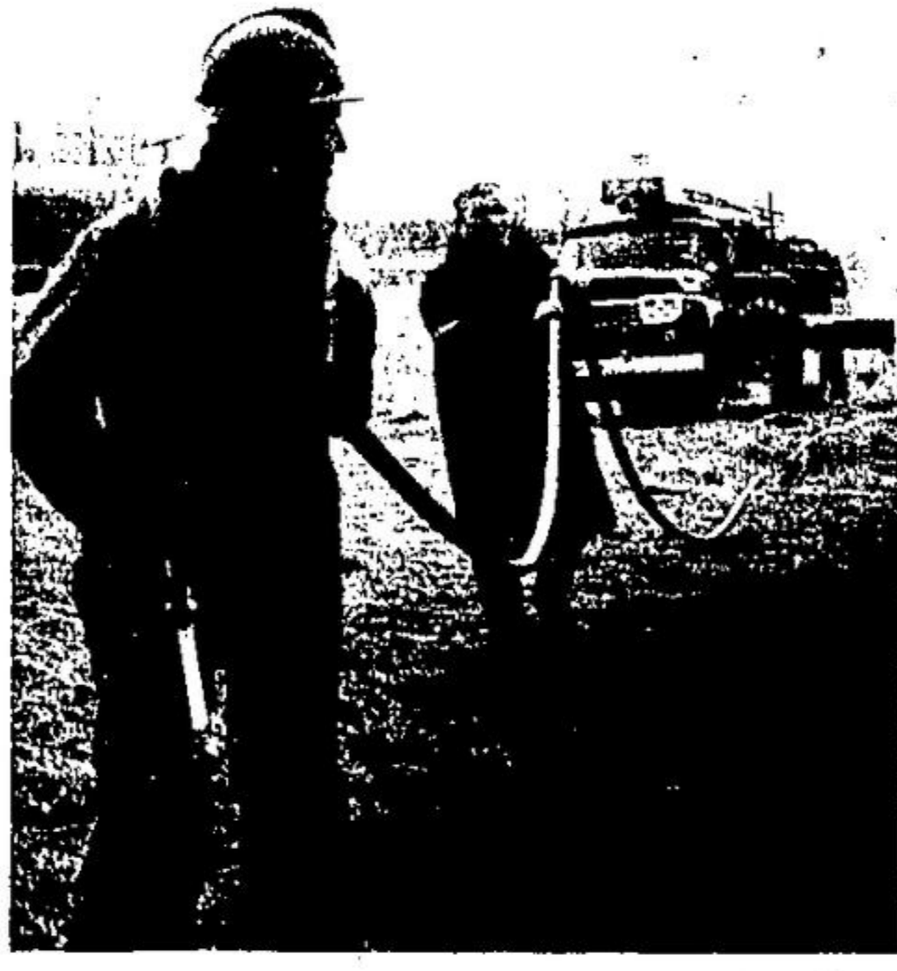
HEAVE-AWAY! Firefighters Lloyd McIntyre and Phil (Scotty) McCristall may not be Volga boatmen but they did plenty of heaving fighting grass and brush fires during the past week.