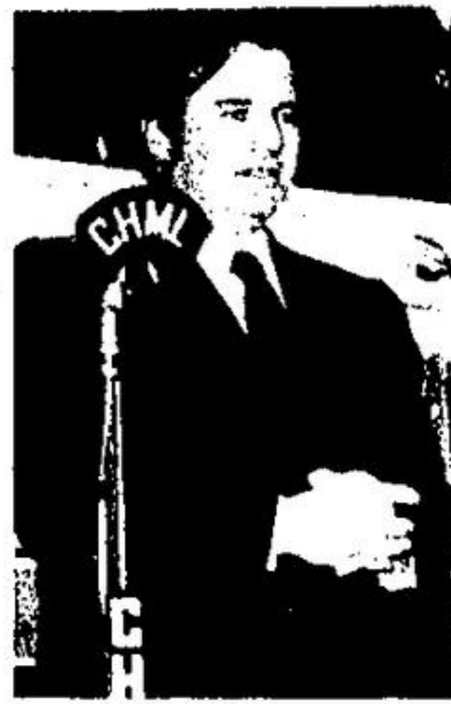
MINISTER OF EDUCATION William Davis

A host of invited officials and dignitaries were on hand Friday when Education Minister Bill Davis opened the new Sheridan