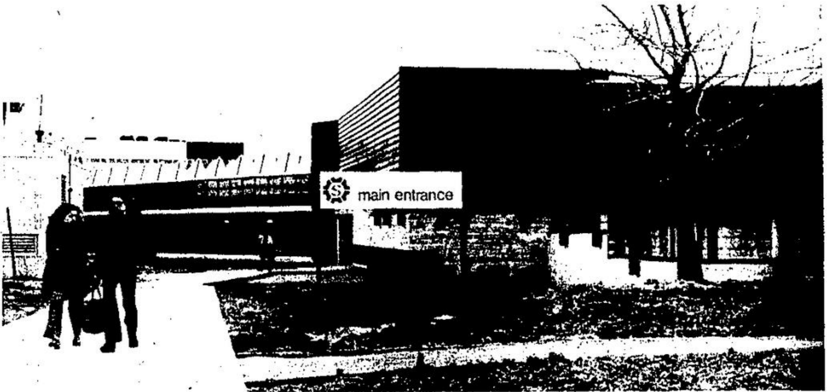
THE NEW SHERIDAN COLLEGE at Oakville represents a whole new concept in school design and architecture. The school is modelled after an open concept idea. Its inward appearance shows much open space. The school will be officially opened this weekend.