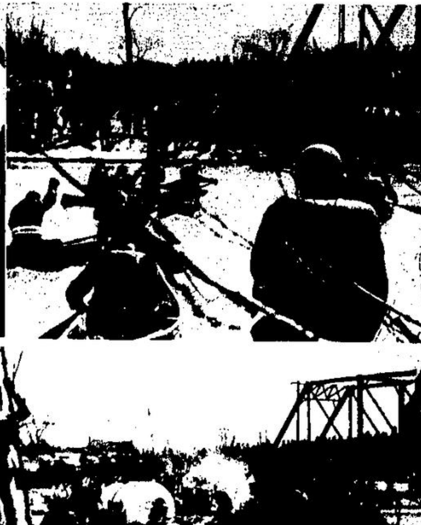
THOUSANDS LINED the banks of the Credit River Saturday for the Georgetown Jaycees Crazy Boat Races and the Free Press camera got some