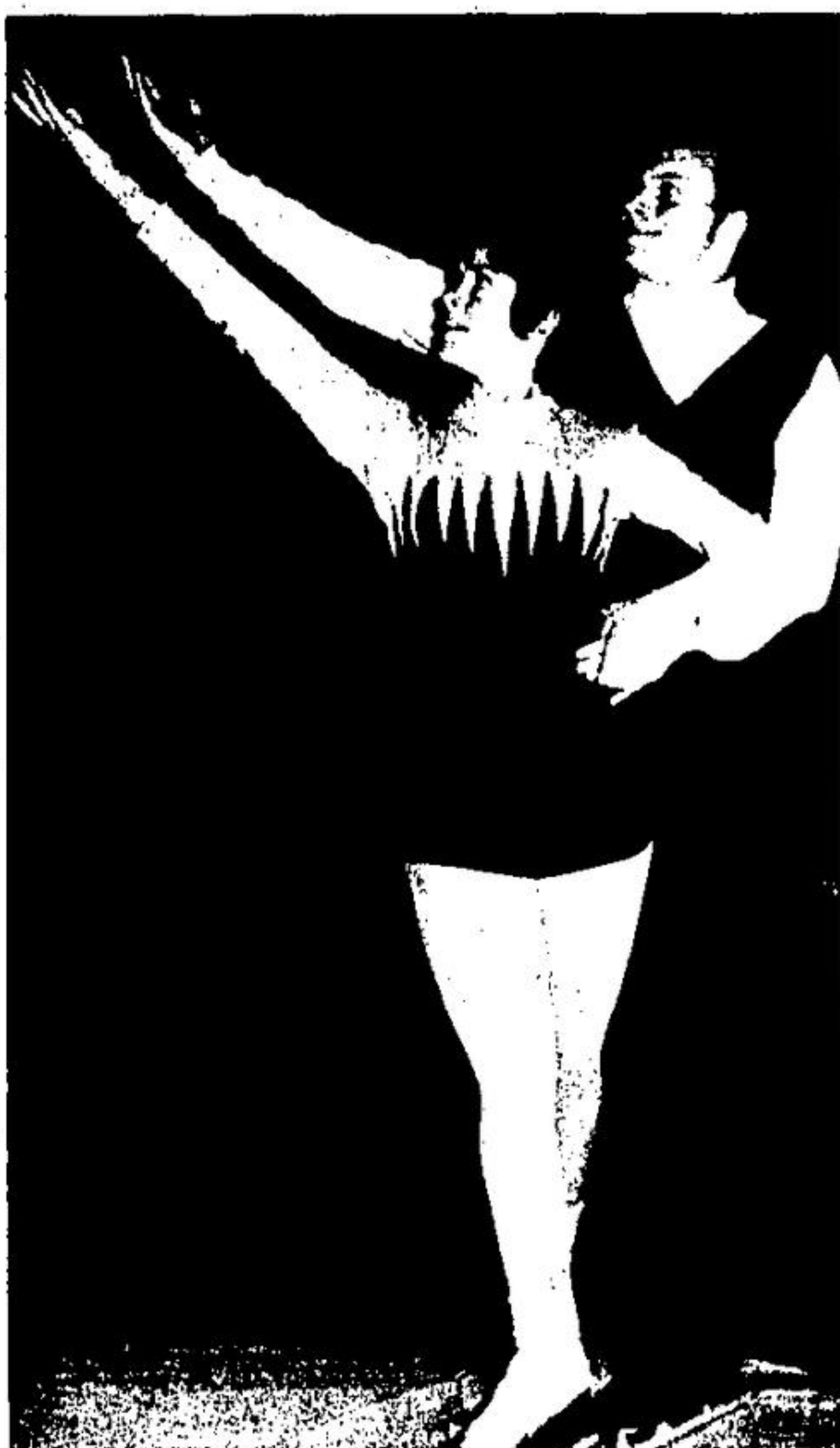
GUEST SKATERS, wearing matching chocolate brown and blue outfits, were Susan Patterson and Mark Linton.—(Staff Photo)