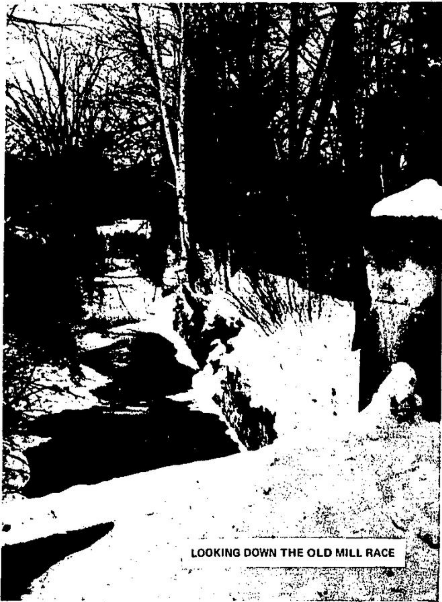
LOOKING DOWN THE OLD MILL RACE