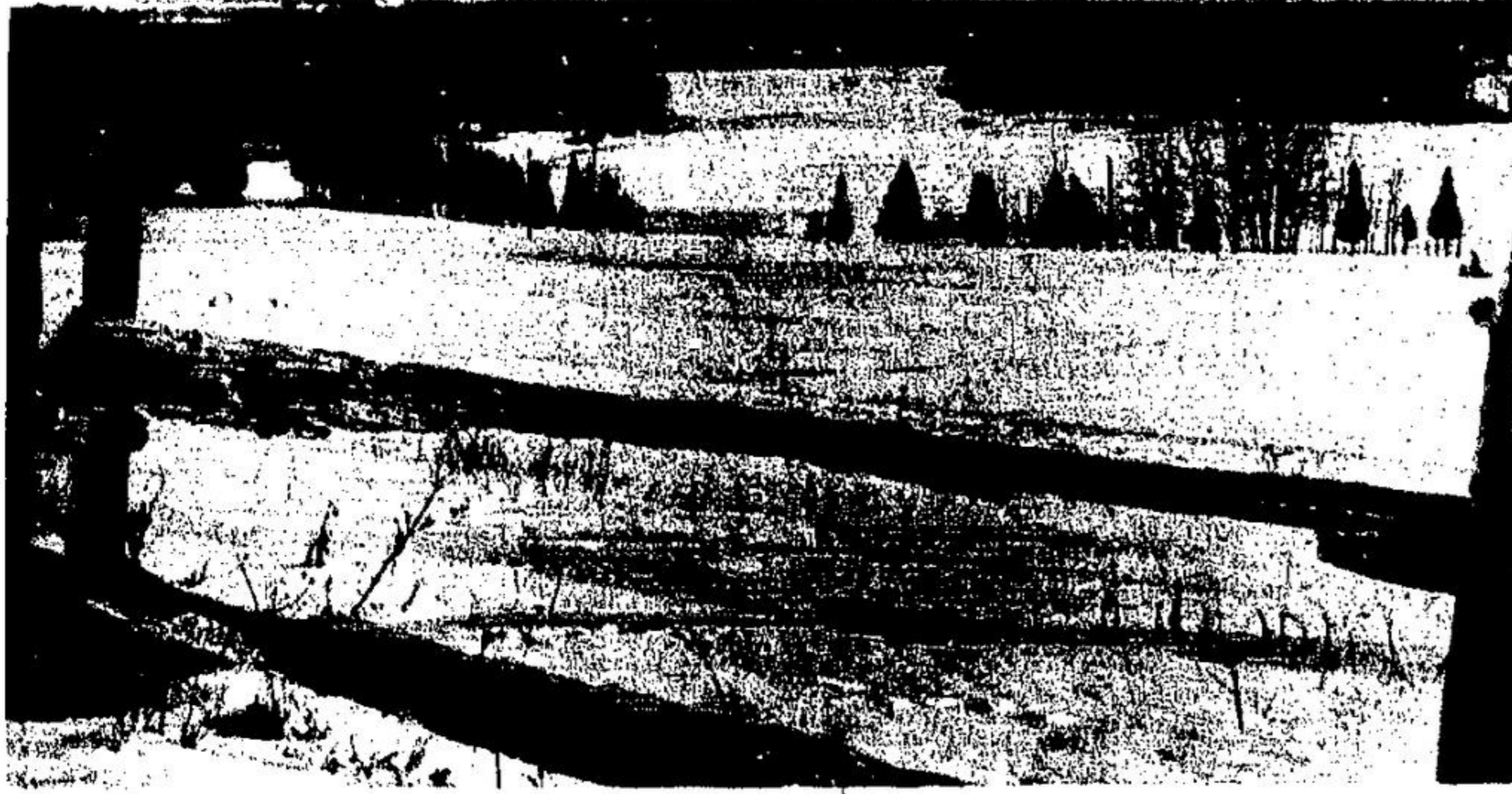
FIRST SIGNS OF spring are evident in the country as snow, still deep, bares grassy knolls and the icy expanse of Fairy Lake seen from the First Line, Esqueving, near Smallwood Acres. The intrusion