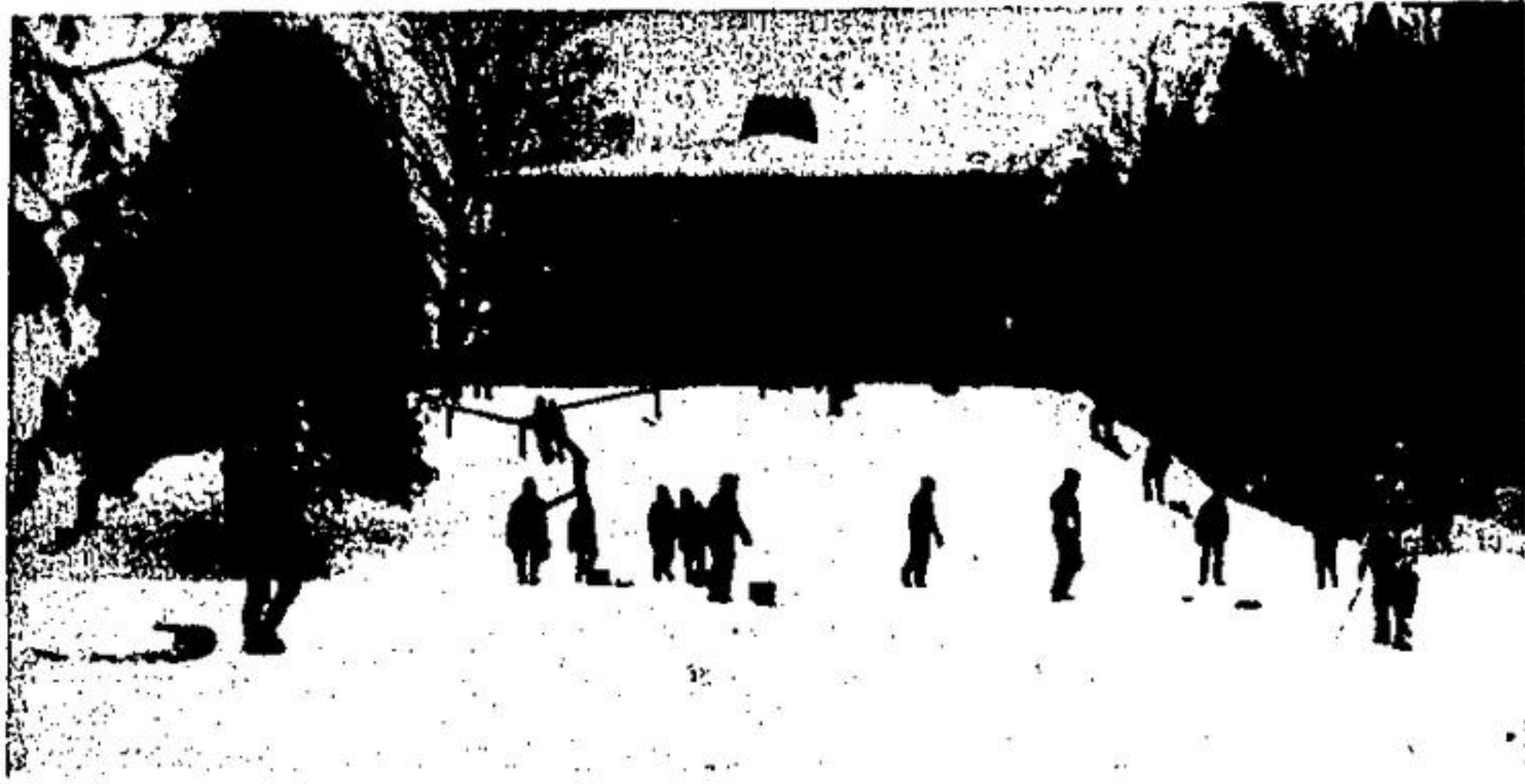
TOBOGGAN RUN just below the pavilion at Rockwood Conservation area saw slides, skids and spills Saturday when Calvinist boys' clubs from Acton, Guelph, Brantford, Galt and Hamilton gathered for a full outdoor program together Saturday.