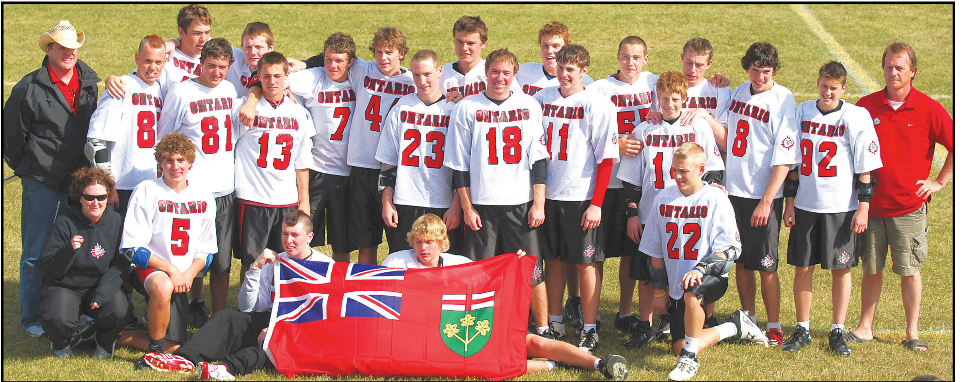
NATIONAL FIELD LACROSSE CHAMPIONS: Halton Hills Midget Field Lacrosse team captured the U16 Alumni Cup, symbolizing supremacy in Canadian National field lacrosse for Under 16 boys in Edmonton, Alberta, on the Labour Day long weekend. The team is made up of 15 and 16-year-old boys, mostly in late Spring which gave them a ticket to the Nationals in Edmonton. The team played like champions for the three days and were undefeated. In the final game against British Columbia they chalked up a 14-9 win. It was a large expense for the families involved and they couldn't have done it without the support of local businesses.