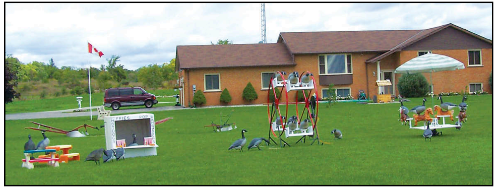
WHATS GOOD FOR THE GOOSE: Our favourite geese, chose not to be outdone by the Prospect Park geese and enjoyed a fair of their own.

EWAG Community Support Service Providing Programs & services to children, seniors, and families in need. Guelph/ Eramosa Township