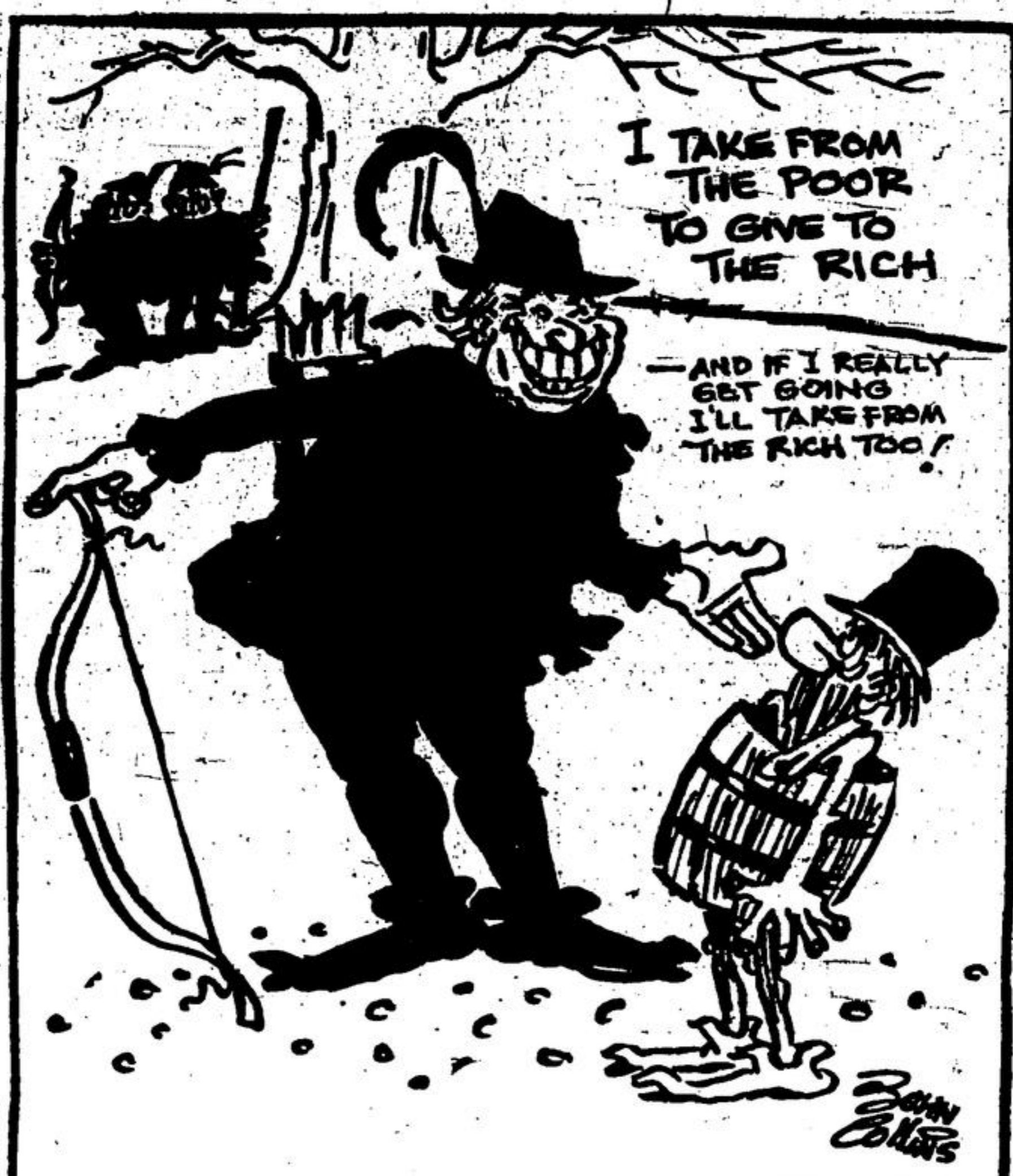
ANOTHER ROBIN HOOD AND HIS MERRY MEN

(10) Never push drinks on guests who are driving. The admonition: "if you drink, don't drive" is still the best rule but too few persons follow it. It is more realistic to expect the host to follow a few guidelines which can stabilize the celebrating and literally assure his motoring guests many happy returns.