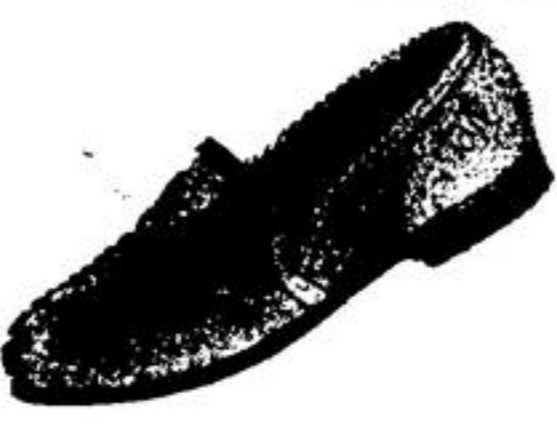
MEN'S SUEDE BARON $5.98