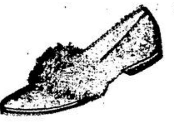
CHILDREN'S 8 to 4 - DEBBIE $3.98