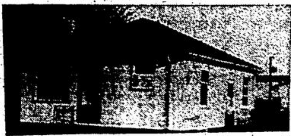
7 Riverview Crescent (off Ewing St.) $14,900

It's small, but the vendor will add a second bedroom for just $2,000. Excellent for retired couple or a dandy starter home. A brand new brick bungalow is now under construction next door at No. 9.