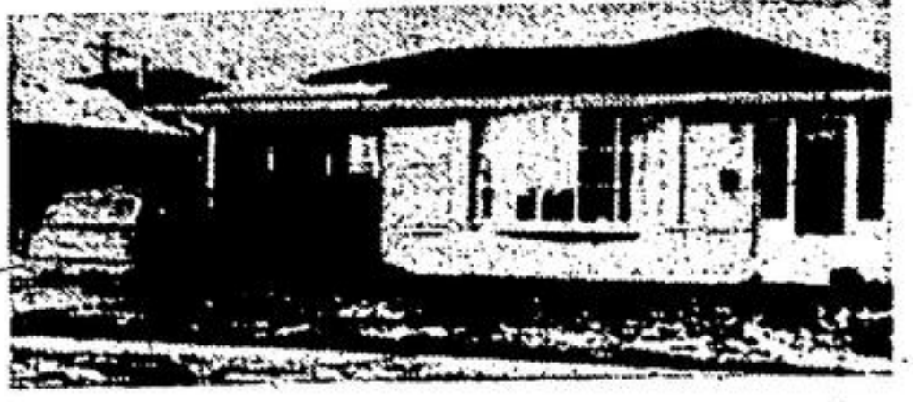
34 Moore Park Cresc. — $26,700

Better Than New — Six room brick with closed in carport and many many extras added. Seamless floor on half the basement for future rec room, water softener, hooded fan in kitchen, basement stairs, fully fenced yard and the best of all, a 7 1/2% first mortgage that carries for $163 monthly including taxes. Hurry for this one! Can be seen anytime but do come Saturday or Sunday between 1 - 4 p.m.