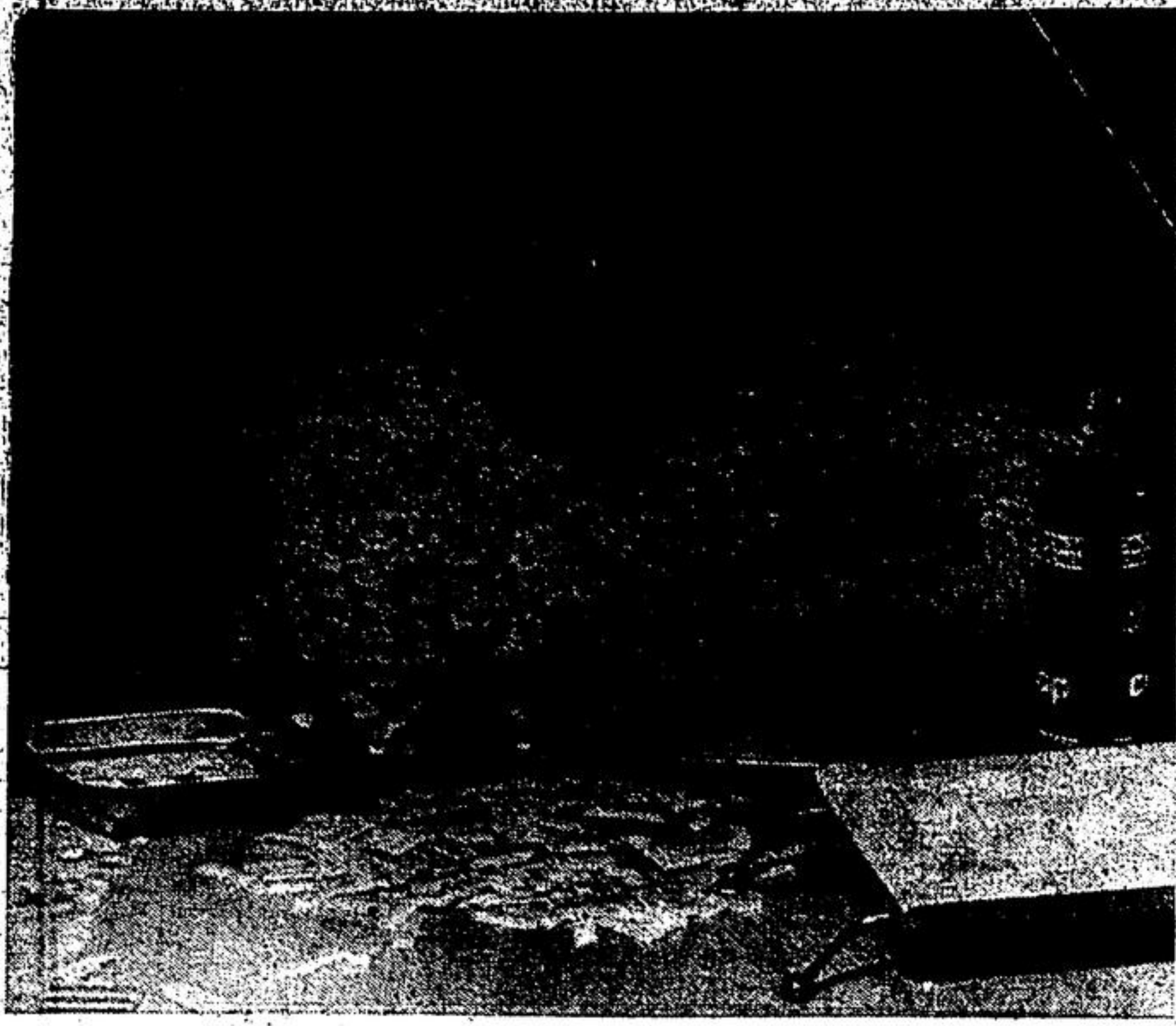
A pot stand and candy dish are two ceramic items made by Patsy Hegarty