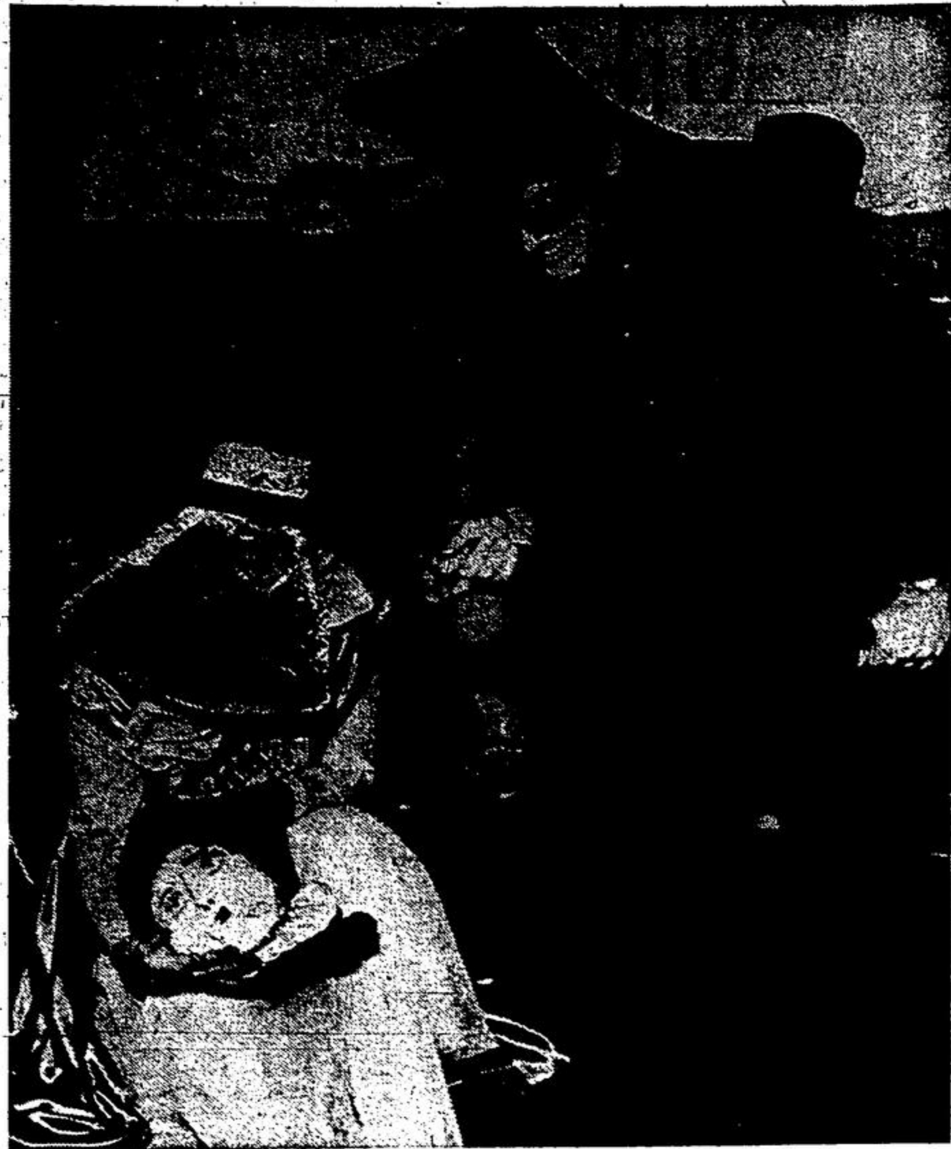
"OFF WITH 'ER 'EAD"