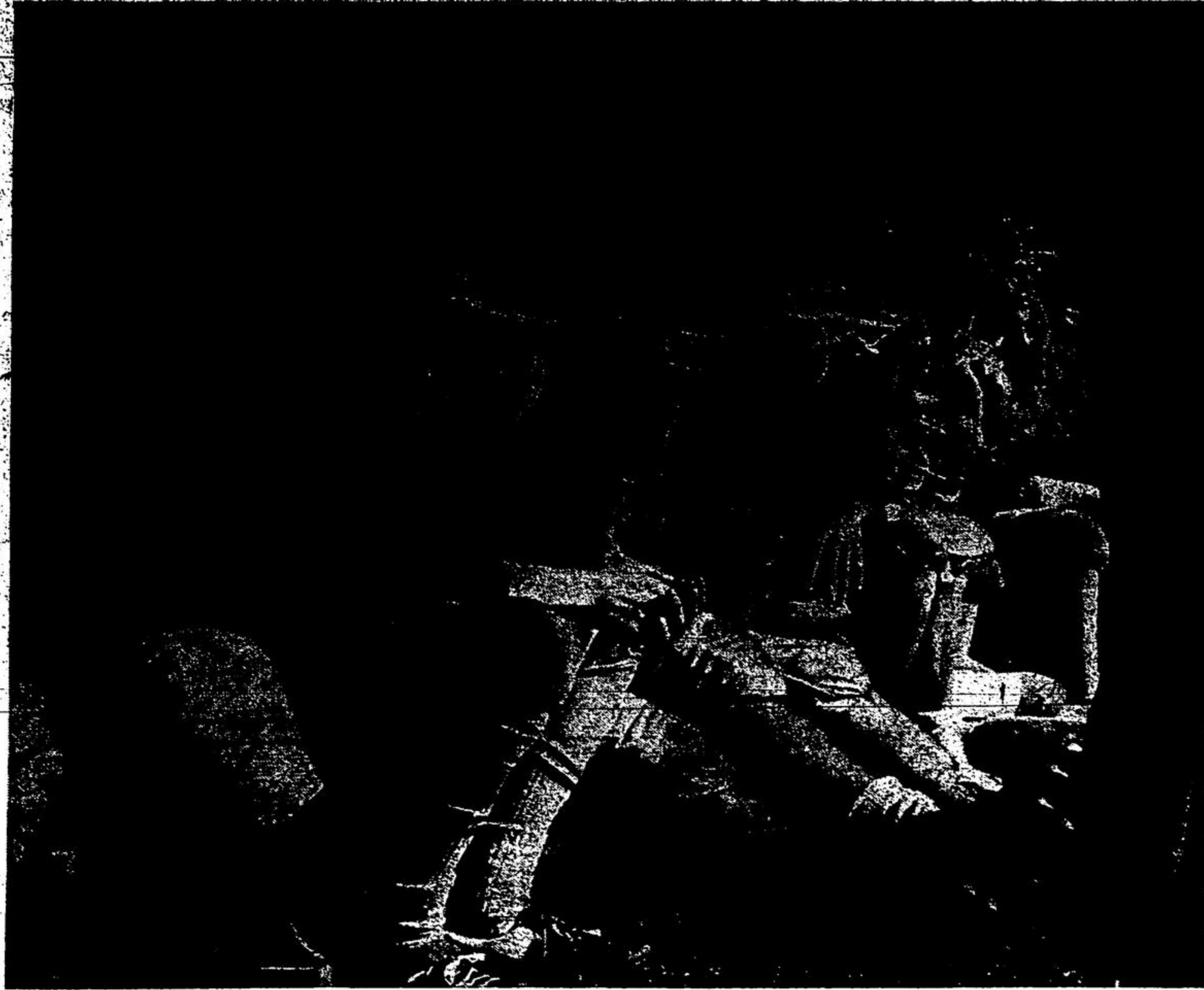
NO JOY ON REBEL BENCH