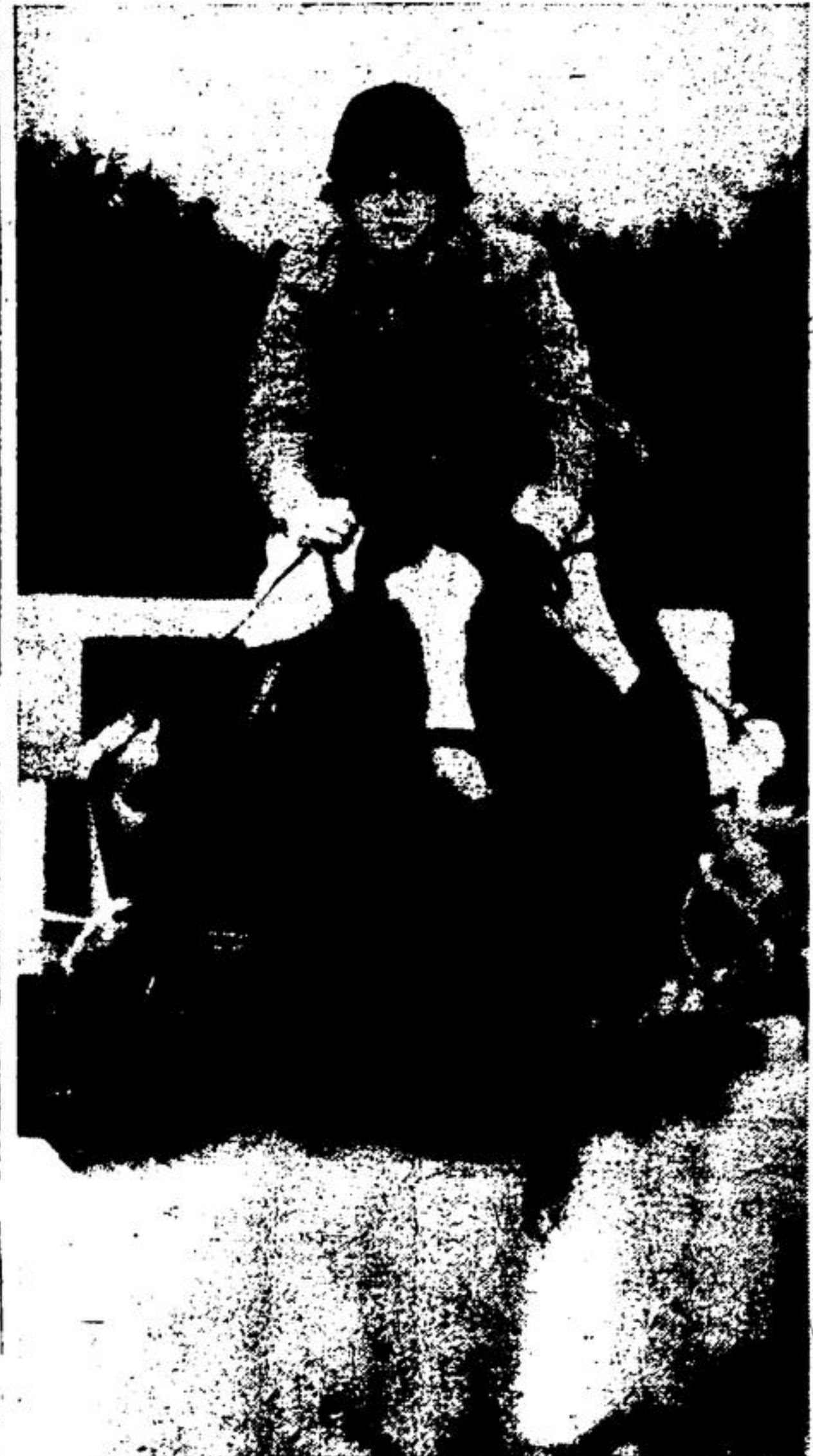
popular features. The jumping competition was again one of the fair's most

Building permits totalling $407,164 were issued in Esquising in September, building inspector Tom McLean told the township council Monday night.