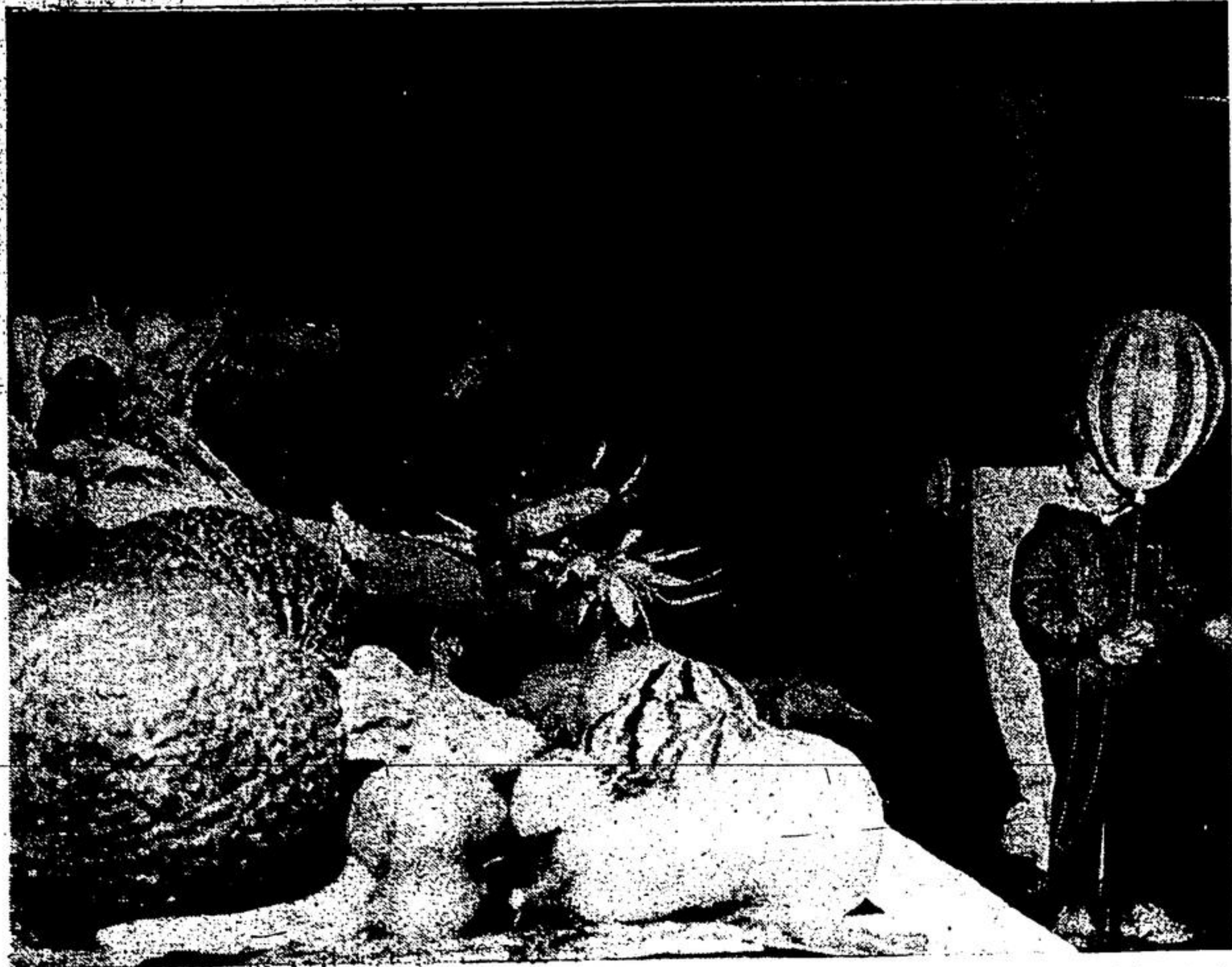
Fairgoers Don Atkins and daughter Allison admire the prize-winning vegetables as they inspect the exhibits in the armoury.

$5.00 per year; Single Copy Price: Ten Cents