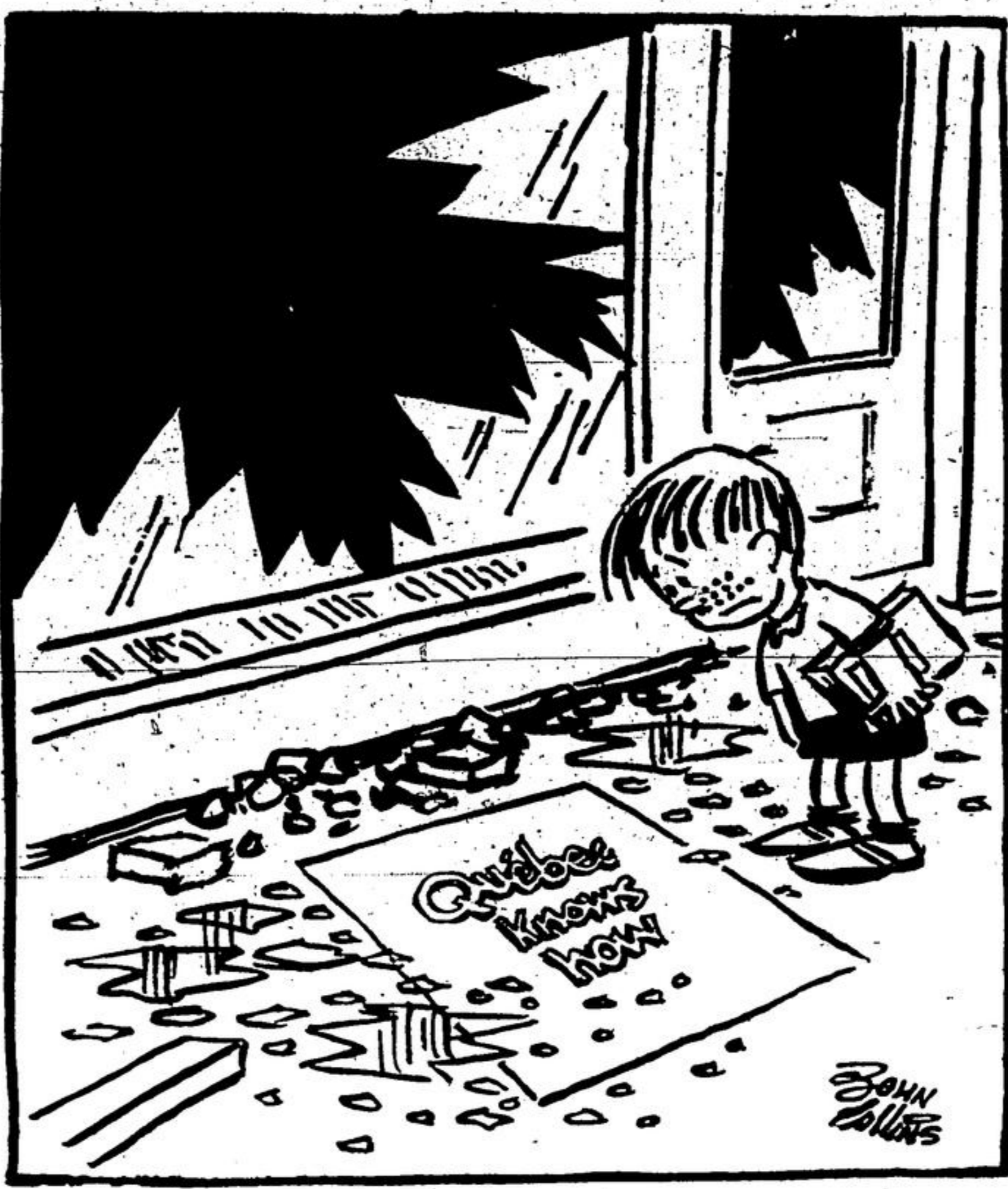
TEACHING THE WRONG LESSONS IN ST. LEONARD

Don't have a one-track mind: Especially, says the Ontario Safety League, when you are waiting for a slow freight train to clear the crossing. Remember that an express may be coming down the other track.