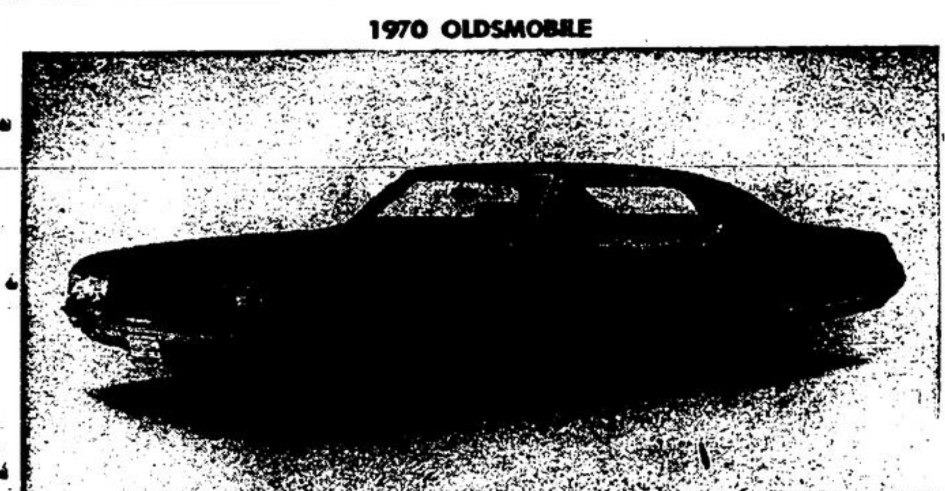
The 1970 Oldsmobiles feature new body styling, with many engineering improvements and safety innovations. These cars are available in distinctive 96 and 88 series, Toronado and F-85, Cutlass, Cutlass Supreme and 442 series. A new model is the Cutlass Supreme Holiday Coupe, seen above, featuring a notch back roof line and ultra-luxurious interior.