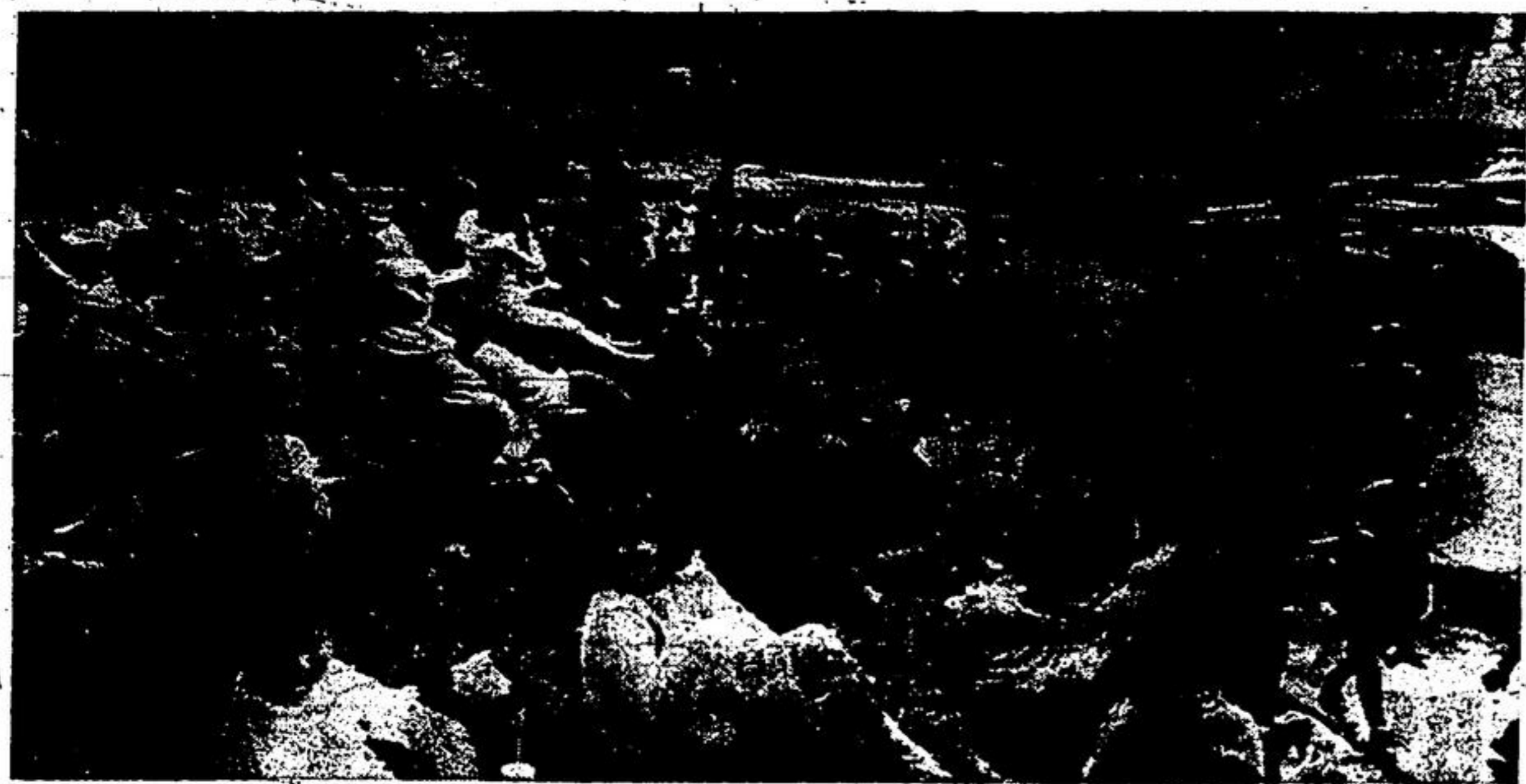
Some walkers rest at the Sacred Heart checkpoint on Guelph Street while others plod up the hill, their journey less than half finished.