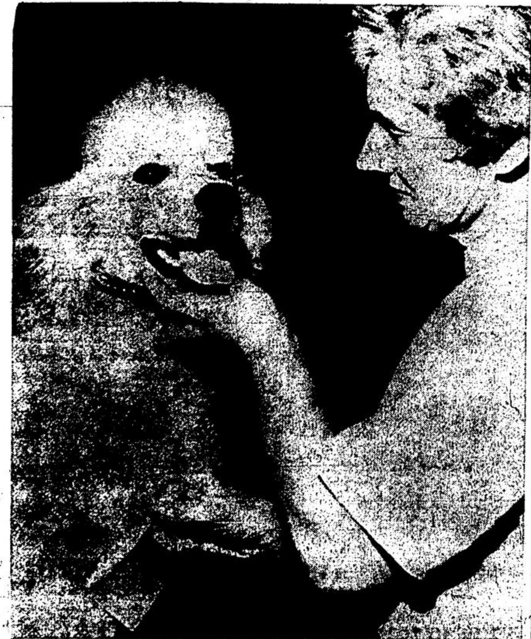
"Hey! That feels good."

THE GEORGETOWN HERALD THURSDAY, FEB. 20th, 1969 PAGE 2