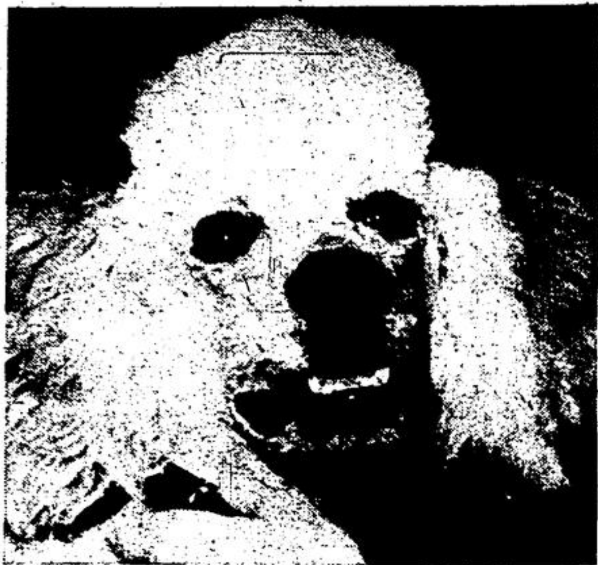
"Imagine me a raving beauty!"

The hobby turned business began when she bought a French poodle for her son, when another dog was killed by a car. She decided to learn how to look after it herself, and registered in the Canadian School of Dog Grooming, known as the House of Poodles in Willowdale.