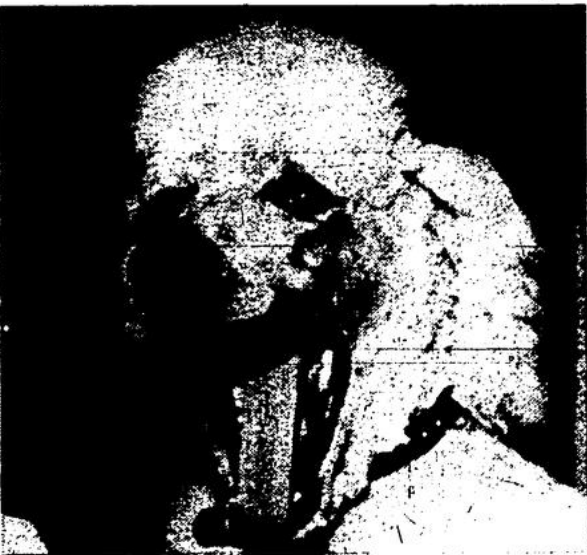
"Ho hum, I wish she'd hurry."