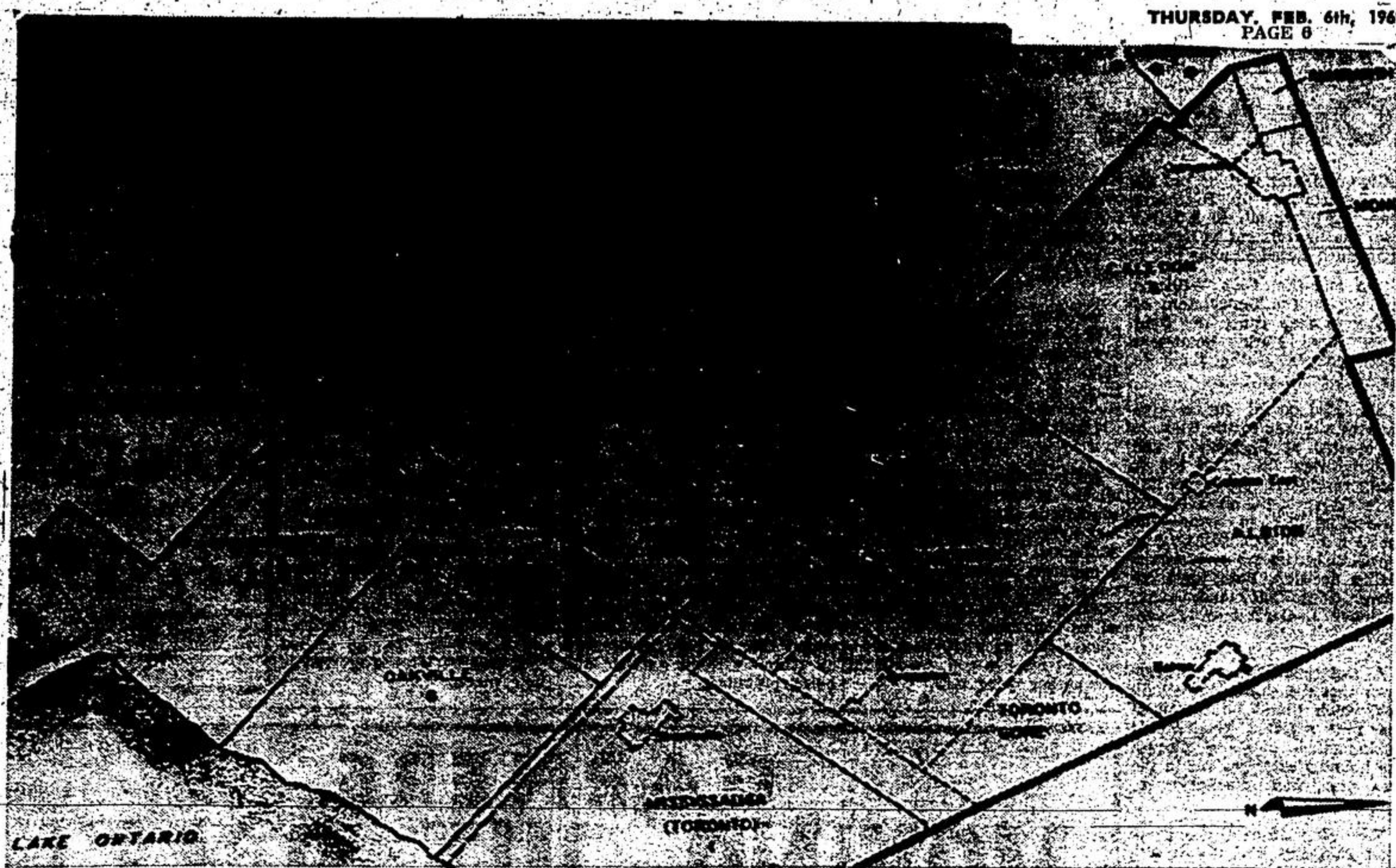
BUFFER METRO — The above Department of Municipal Affairs map of the new regional municipality proposed by Hon. Darcy McKeough, Minister of Municipal Affairs shows the seven area municipalities as defined in his January 22nd announcement. The region would have an initial population of close to 400,000.

AREA 1 — That part of the existing town of Mississauga south of the Derry Road, including the towns of Port Credit and Streetsville; a small section of East Oakville is also included; the 1968 population of this area is estimated at 135,000 and the area would have seven members on the regional council;