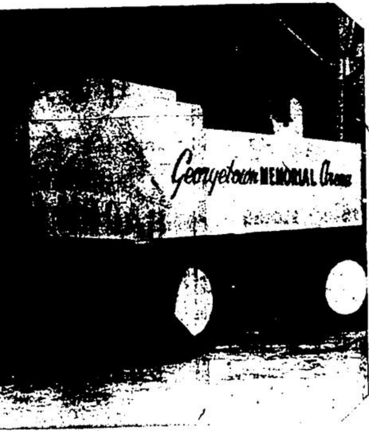
na purchases... treatment machine ending era of the 'rink