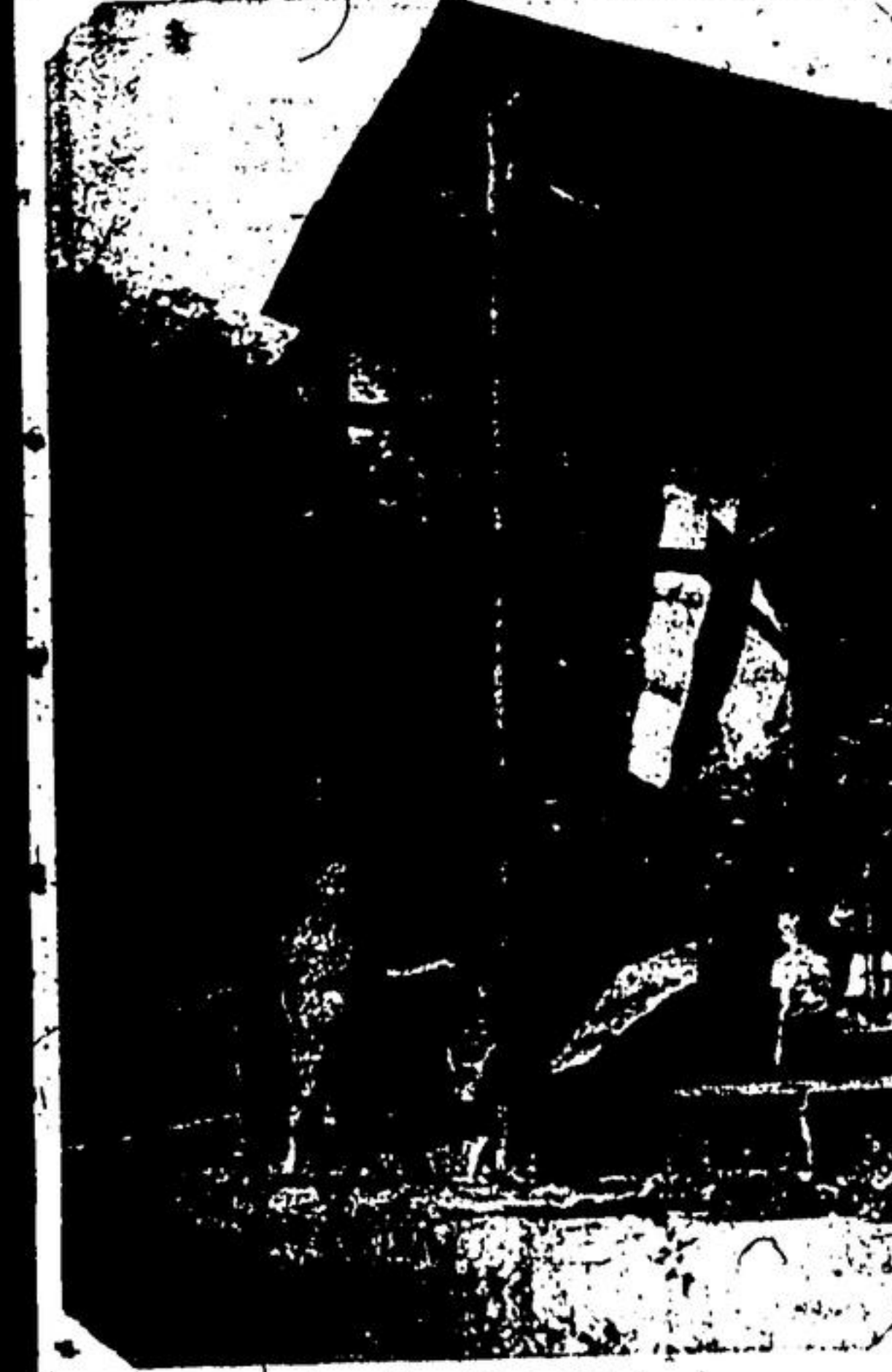
AUGUST — Park grandstand is lost in fire.