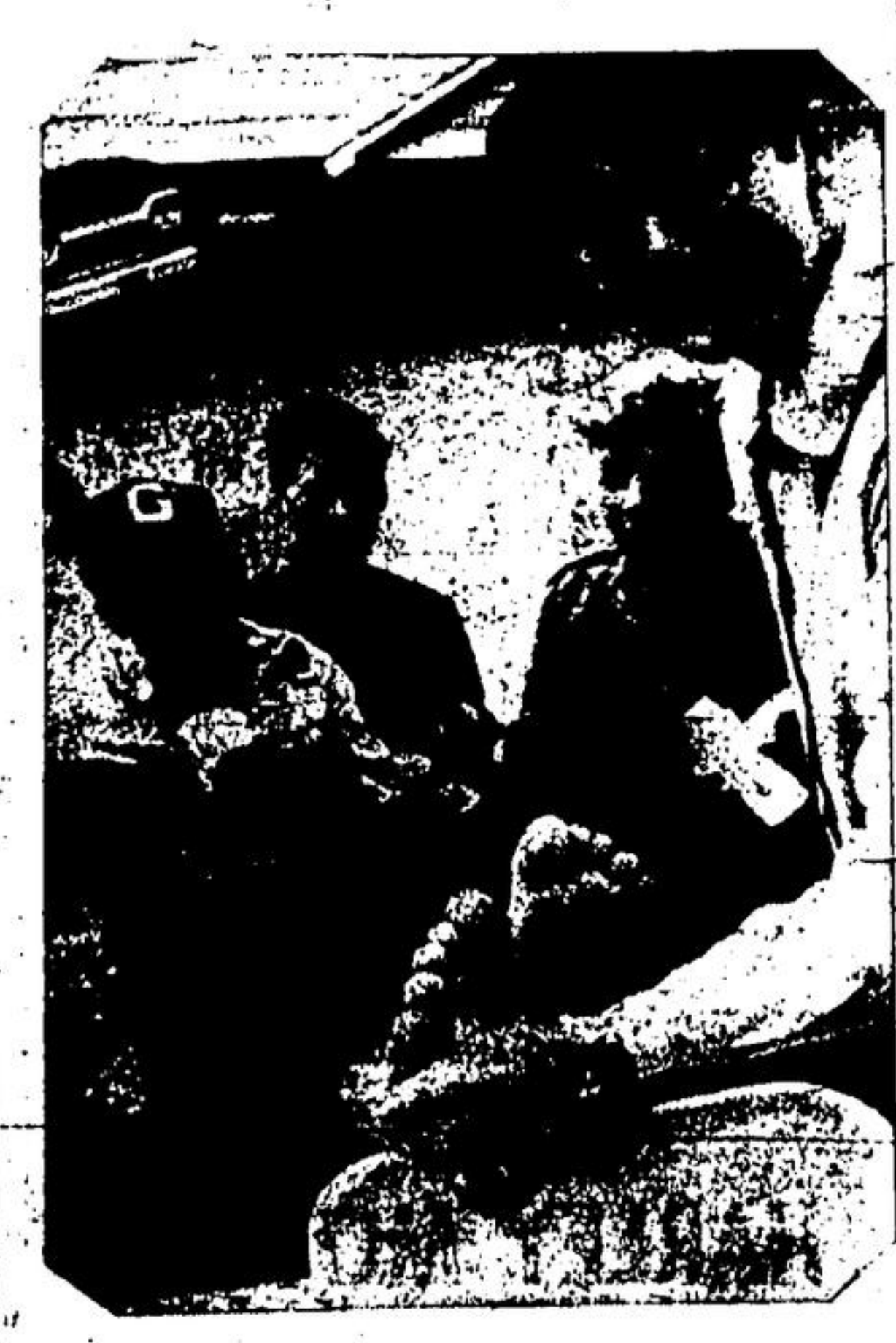
MAY — Sore feet are the order of the day as 3200 parade through town on Oxfam Walk.