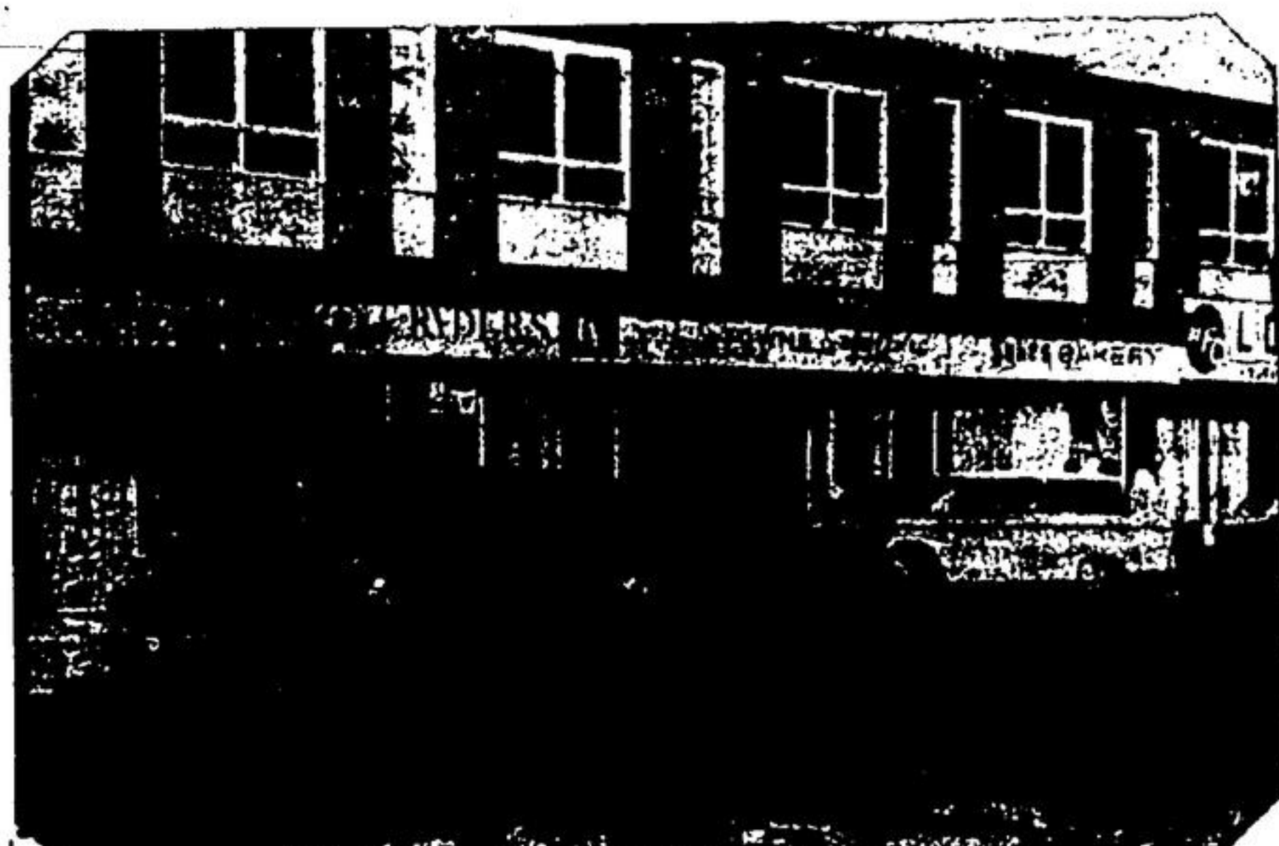
MARCH — Woodrex Building with five new stores is unveiled extending downtown business section.