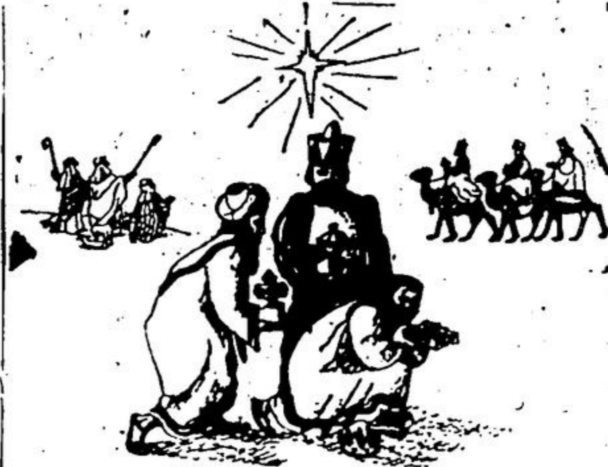
THE WISE MEN — This montage depicts the wise men journeying through the desert, following the star that shone above the manger in which Jesus lay, and bearing their gifts to the new born Messiah. It also shows the shepherds who saw the star while tending their flocks. The Goodrich Christmas special, 'Christ is Born', recounts the most famous of the Christmas stories.

Perhaps one of the most unusual Christmas traditions is the one still adhered to by some Swiss romantics. These folks advise a boy or girl to visit nine different fountains and take three sips from each at the time the bells are ringing for midnight services on Christmas Eve. After this odd rite has been completed, the future husband or wife will be standing at the door of the church and a regular courtship will begin—if the spell has worked.