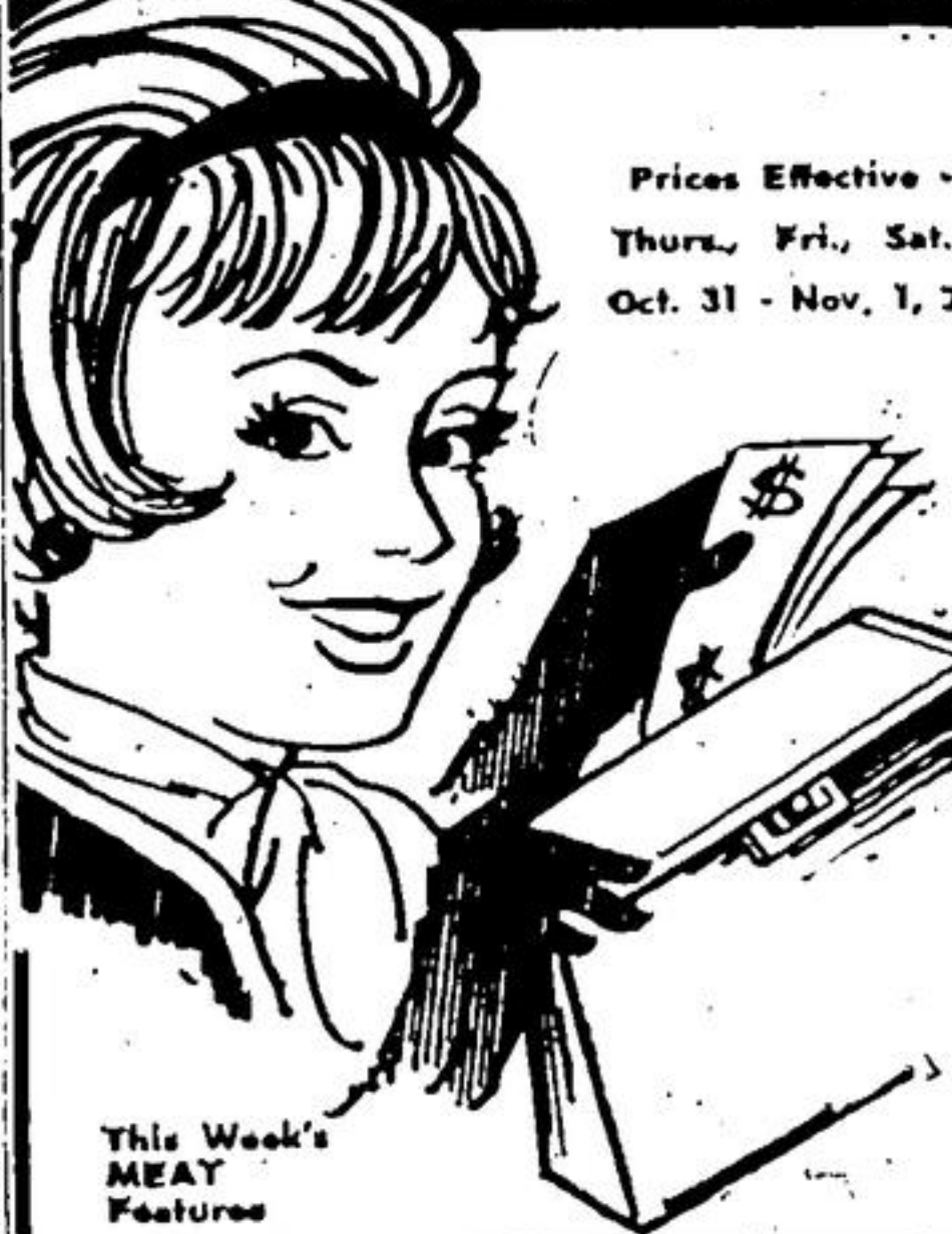
This Week's MEAT Feature

Prices Effective Thurs., Fri., Sat., Oct. 31 - Nov. 1, 2