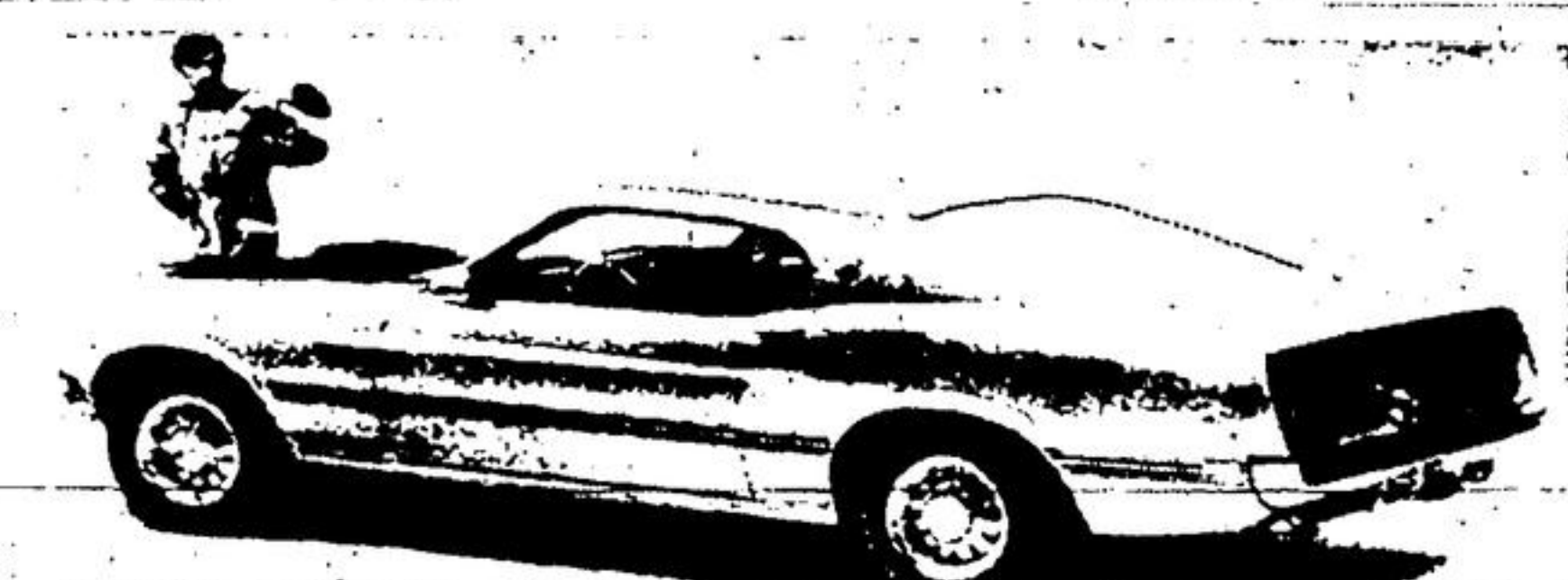
THE MUSTANG MACH 1