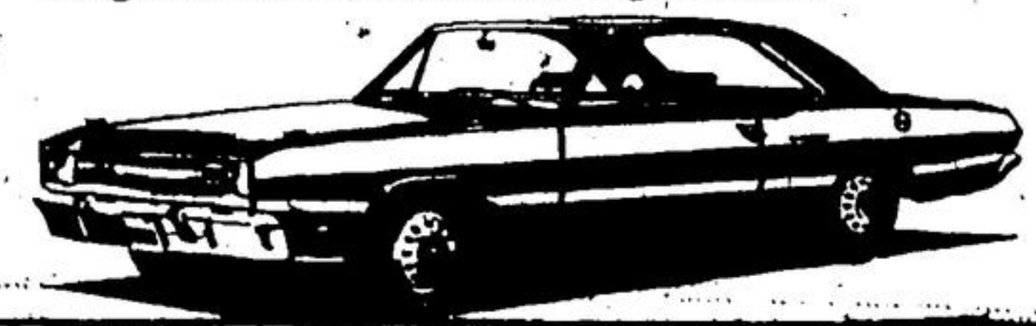
Design '69 Dodge Dart. Compact lovers never had it so big.

NOW ON DISPLAY AT: PHILLIPS CHRYSLER DODGE Limited