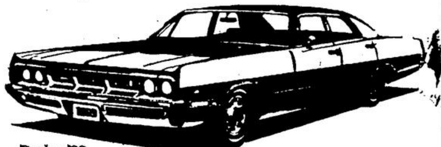
Design '69. Dodge Monaco and Polara. Big in everything but price.