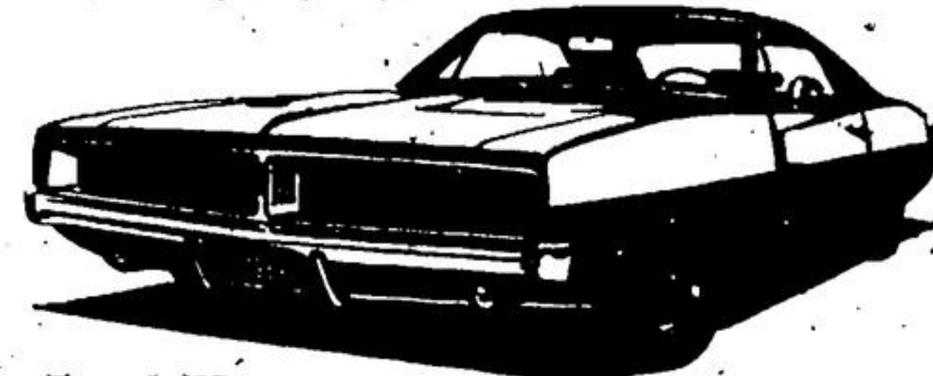
Formula '69 Dodge Charger. Here's what performance is all about.