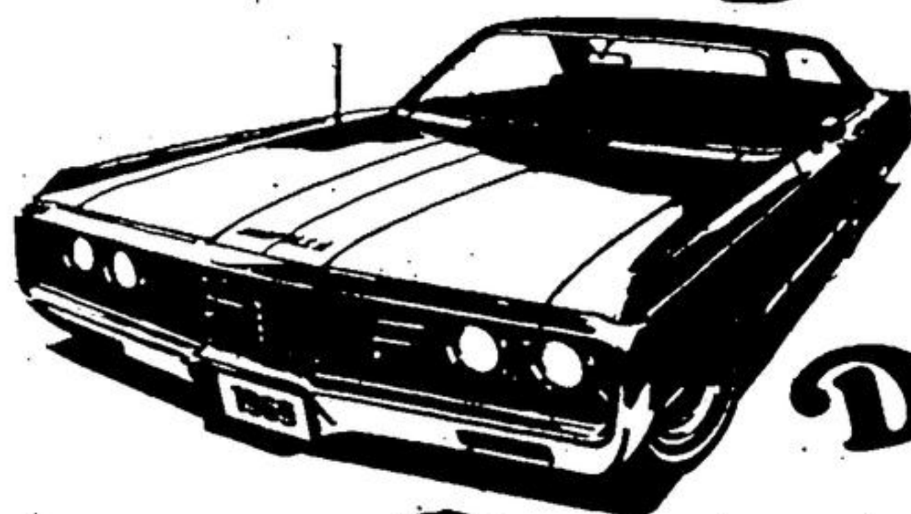
1969 Chrysler. Your next car in four great series: Newport, Newport Custom, 300 and New Yorker.