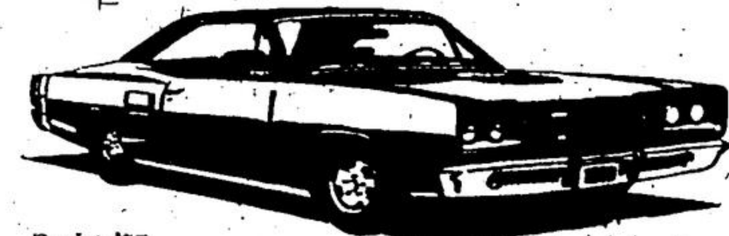
Design '69 Dodge Coronet. It costs a little less to go first class.