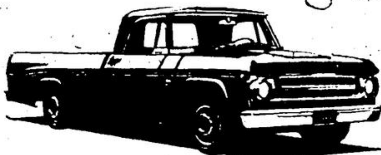
Dodge Super Truck '69 with Cushioned-Beam Suspension. Now ride. Now handle. Now inside. Now outside.